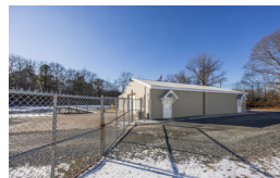
FENCED IN YARD