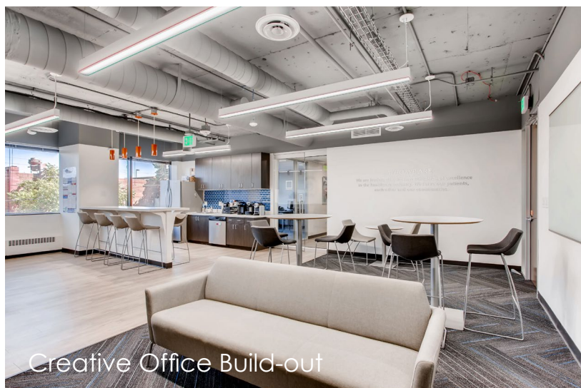
Creative Office Build-out