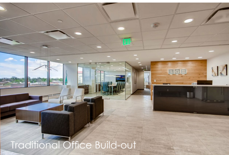
Traditional Office Build-out