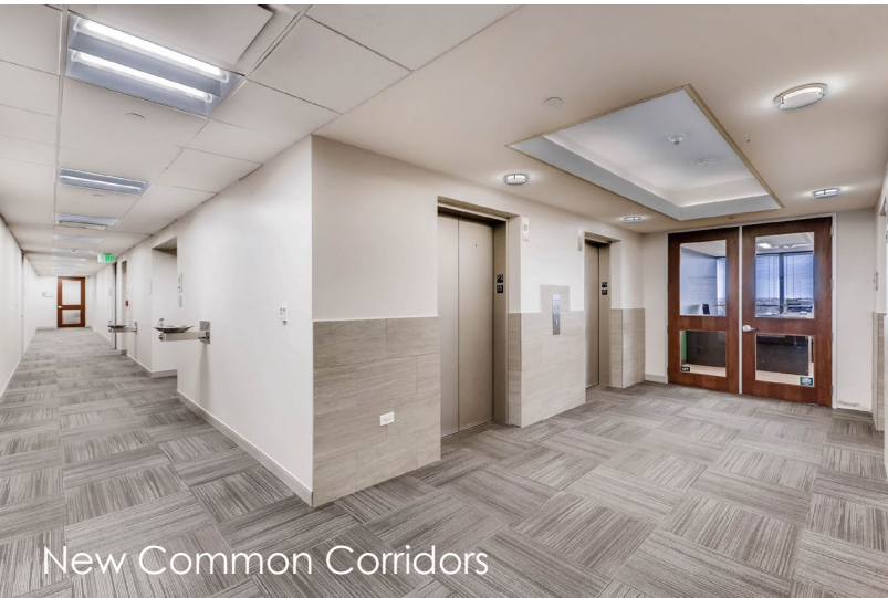
New Common Corridors