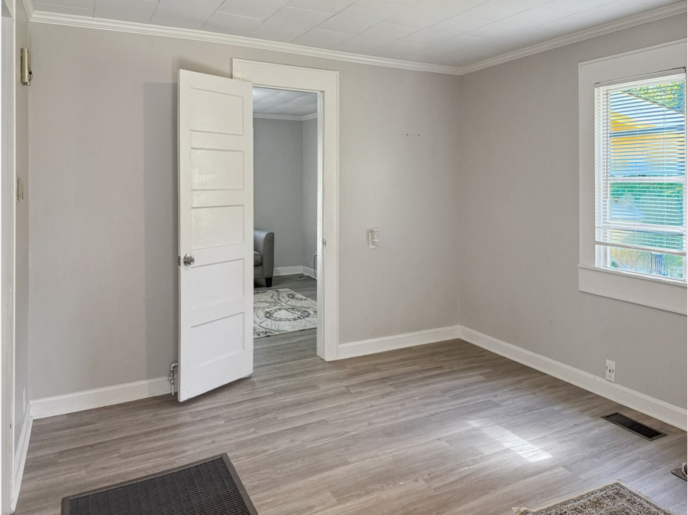
Middle Right Office