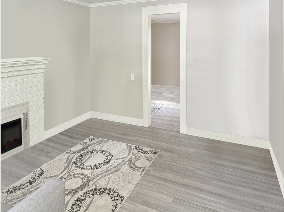
Front Left Office