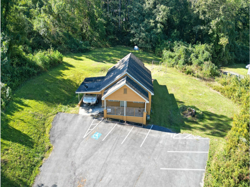
Aerial of Building