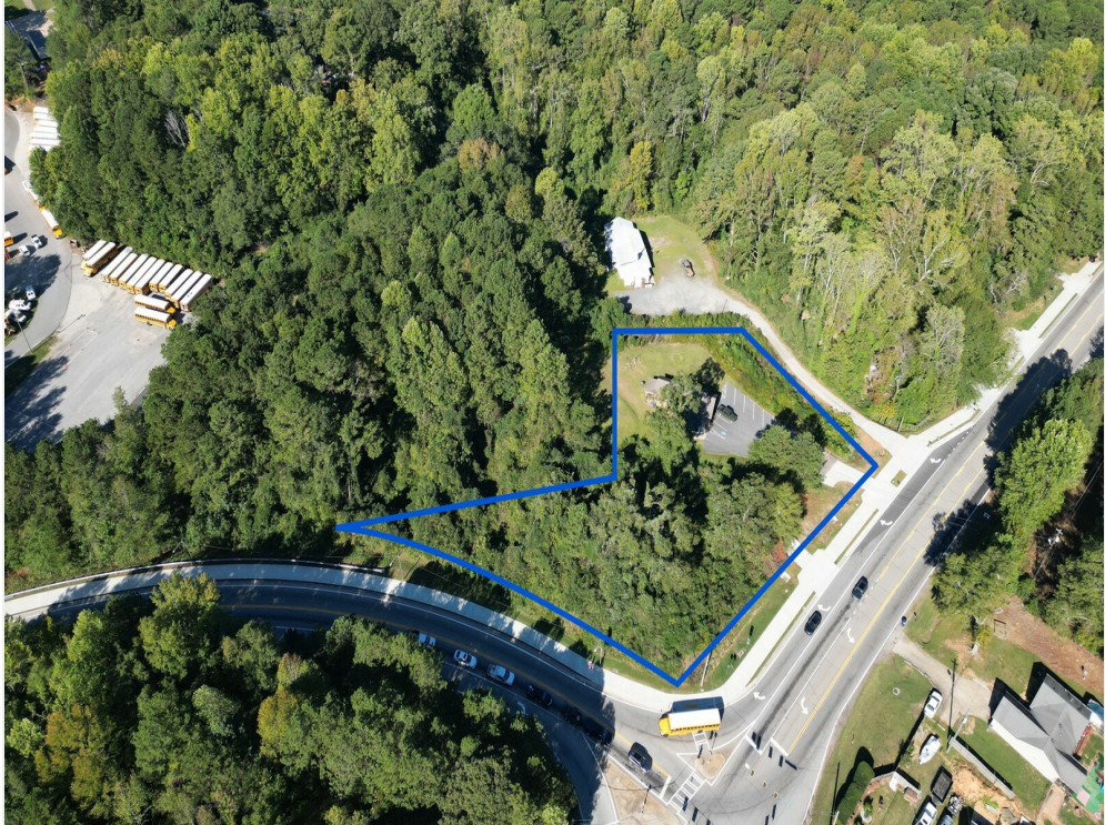
Approx. Property Lines