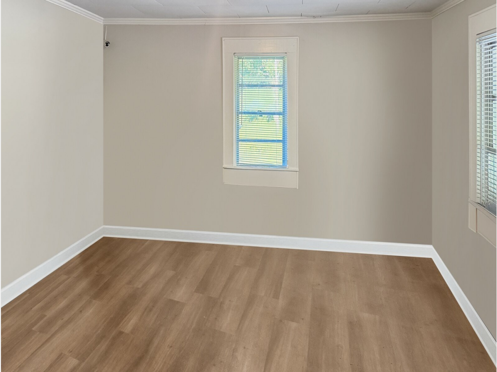
Front Right Office