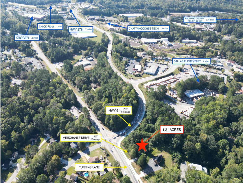
Property Location Map