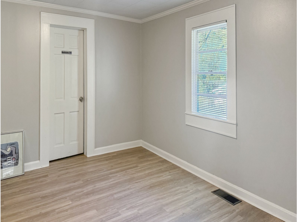
Middle Left Office