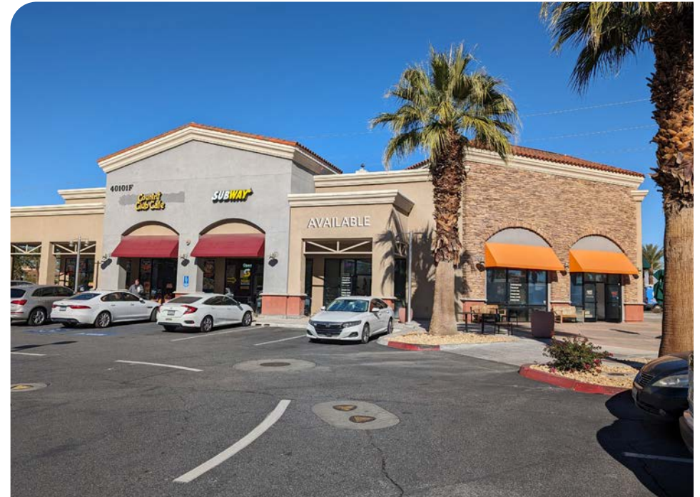
Suite F2 - 1,480 SF Total