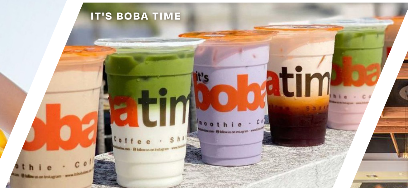
IT'S BOBA TIME