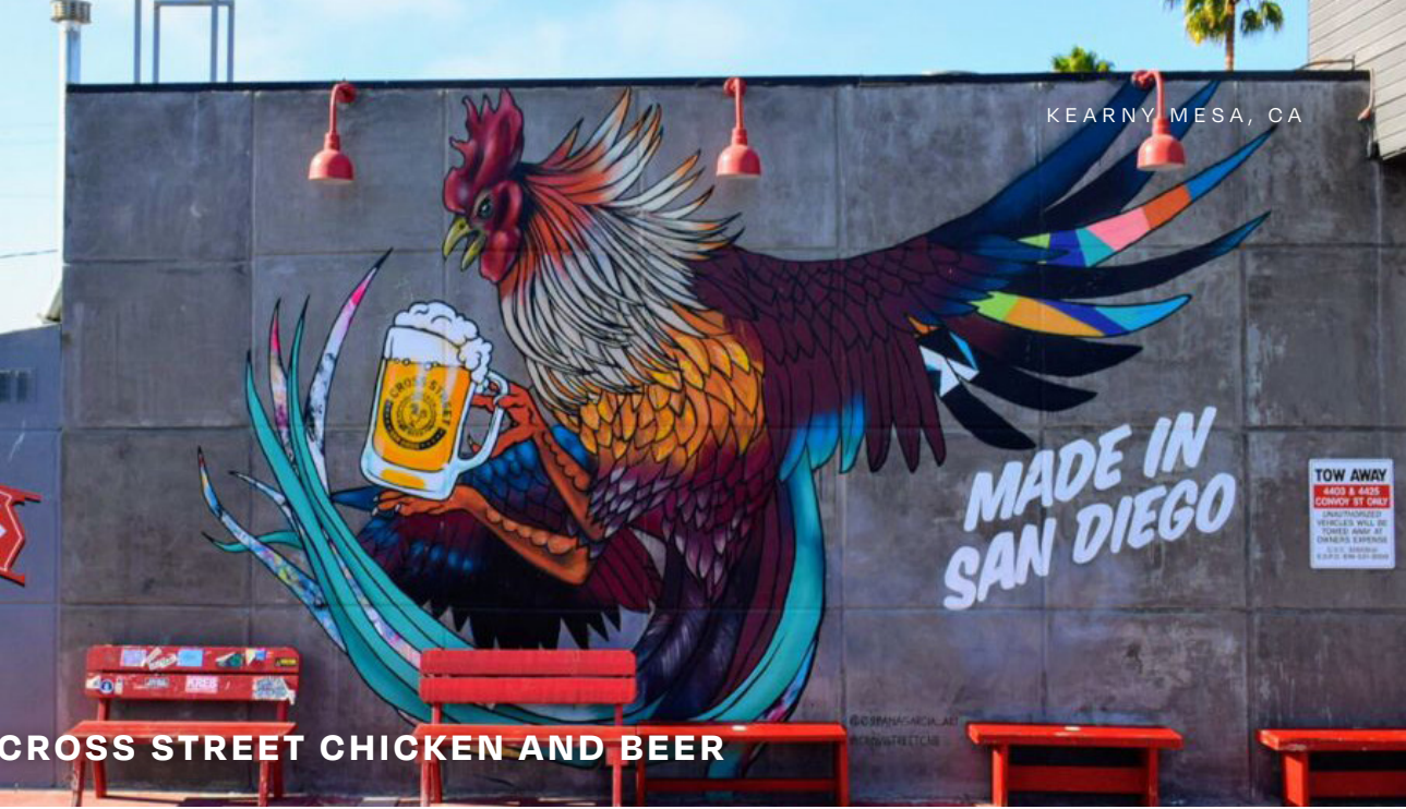
CROSS STREET CHICKEN AND BEER