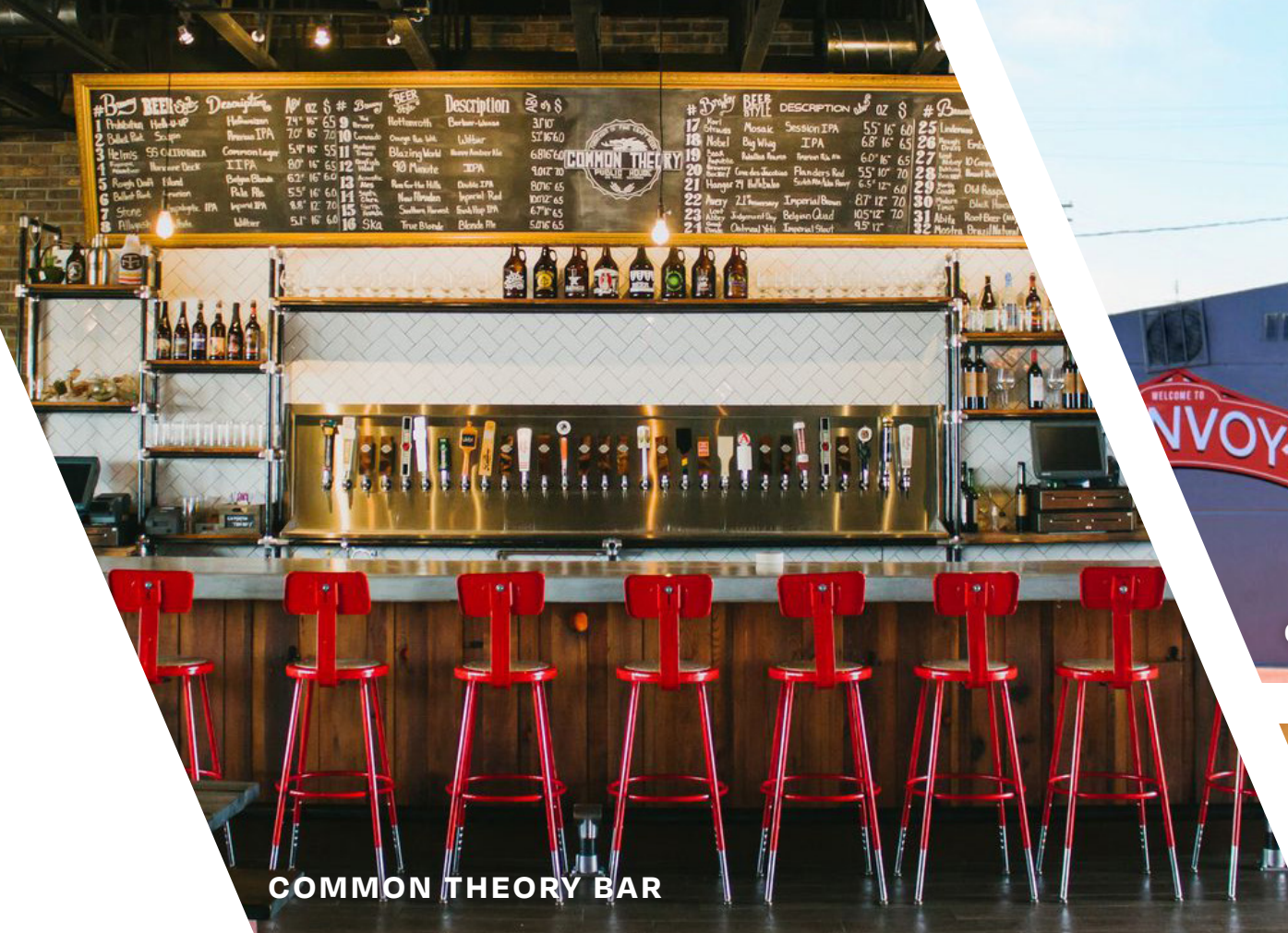
COMMON THEORY BAR

Kearny Mesa is a community teeming with culture and adventure. Highly regarded as one of the major destinations for culinary flare, this vibrant town has been a long-standing draw for both locals and tourists. Recent initiatives to densify the area are bringing in a new wave of shoppers, residents, and employees. Kearny Mesa is one of San Diego's hidden gems, where the intersection of industry and art collide into a diverse, bustling community. Come visit this incredibly unique neighborhood and explore everything it has to offer.