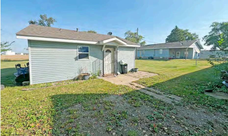
SMALL COTTAGE - 2 Bed, 1 Bath