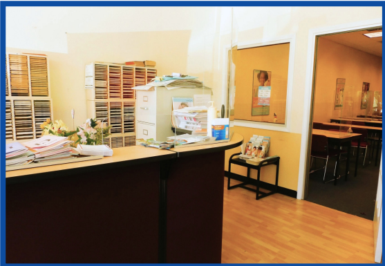
Suite 111 1,408 SF