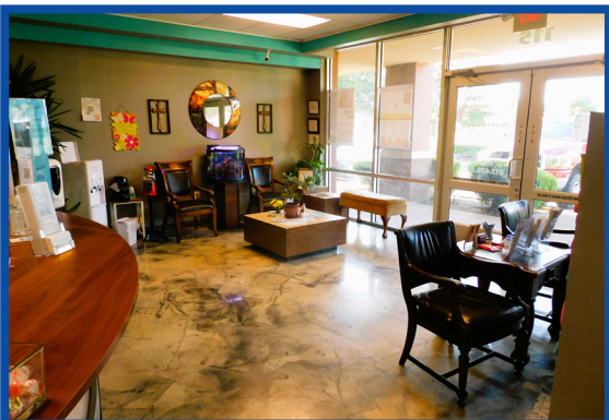
Suite 115 2,728 SF