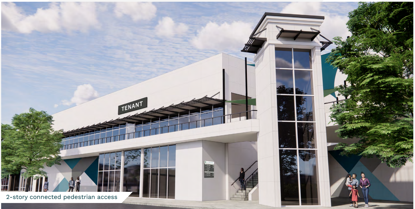
2-story connected pedestrian access