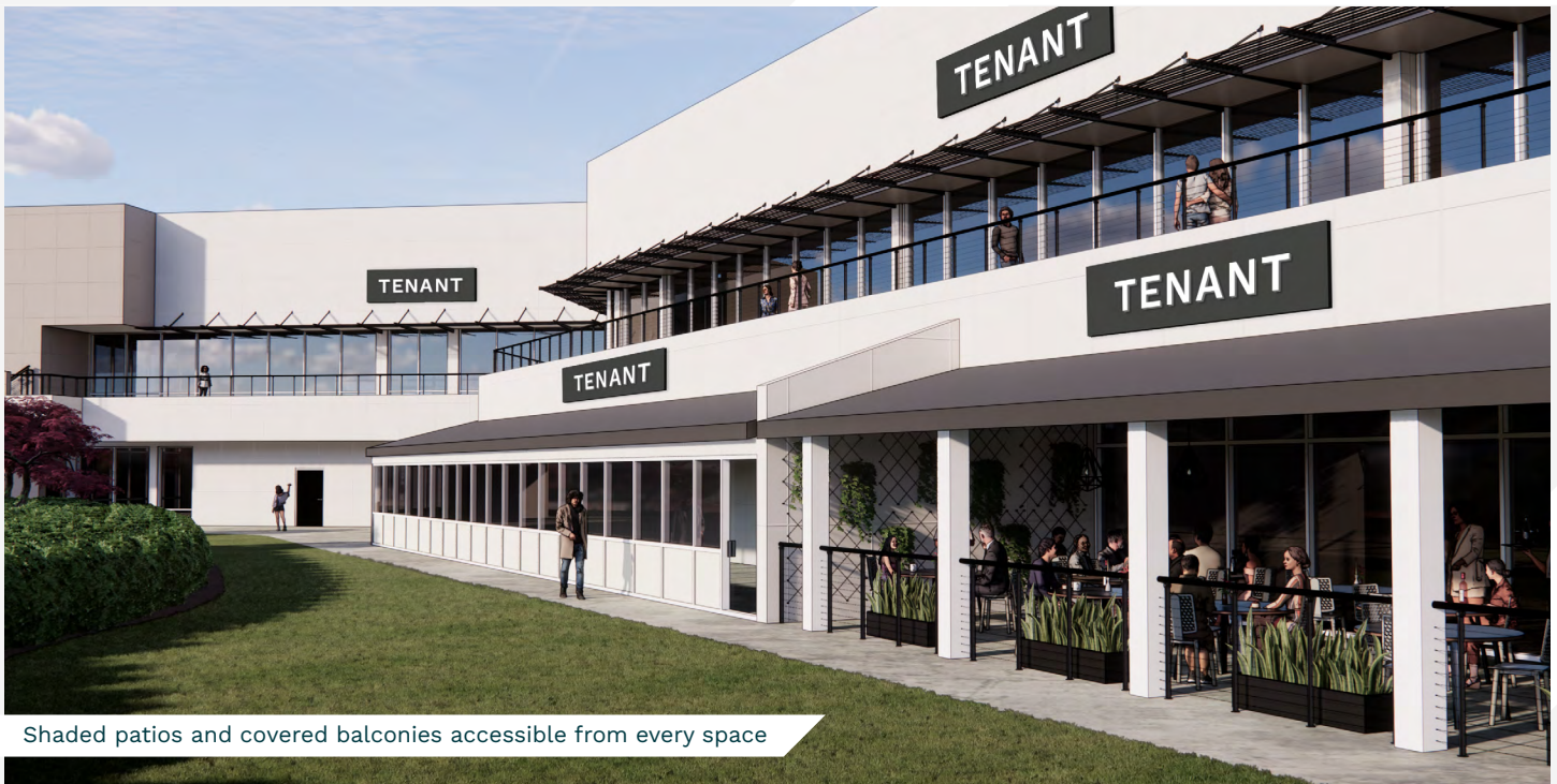
Shaded patios and covered balconies accessible from every space