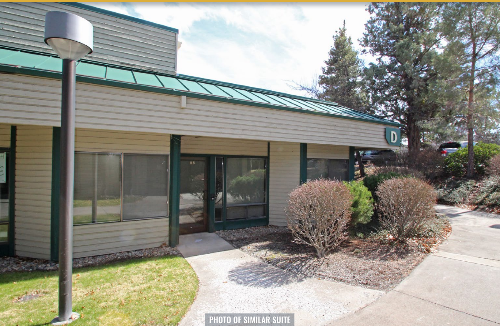
PHOTO OF SIMILAR SUITE