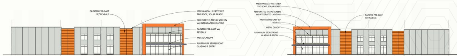
WEST ELEVATION 3/64" = 1'-0"