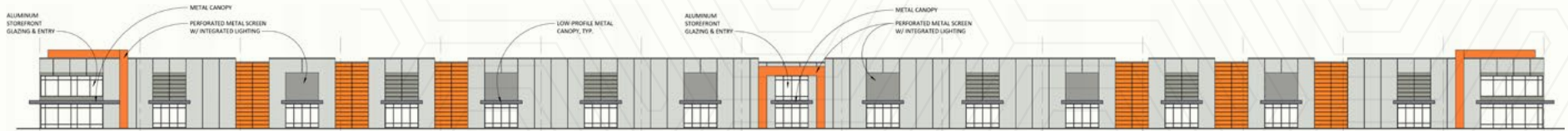
SOUTH ELEVATION 3/64" = 1'-0"