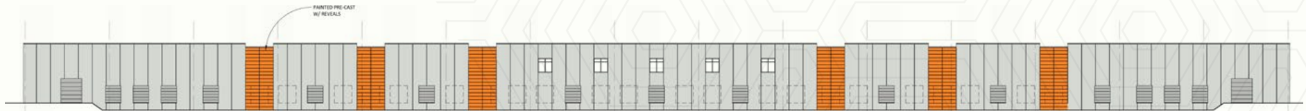
NORTH ELEVATION 3/64" = 1'-0"