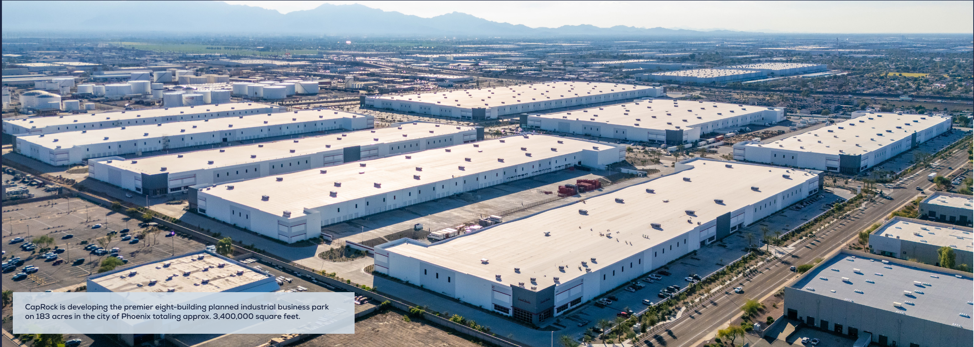
CapRock is developing the premier eight-building planned industrial business park on 183 acres in the city of Phoenix totaling approx. 3,400,000 square feet.