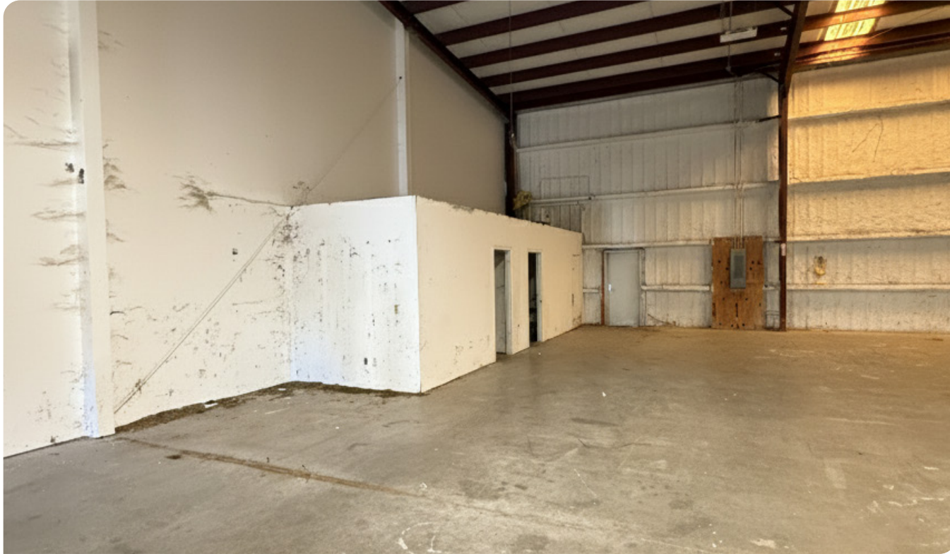
SUITE A: (+/-) 5,100 SF