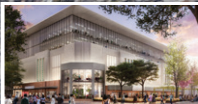
THE ION | 4201 MAIN ST 300,000 SF office, academic, restaurant, & event space