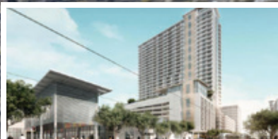
THE TRAVIS | 3300 MAIN ST Brand new luxury apartment high-rise 328 Units, 14,00 SF of retail