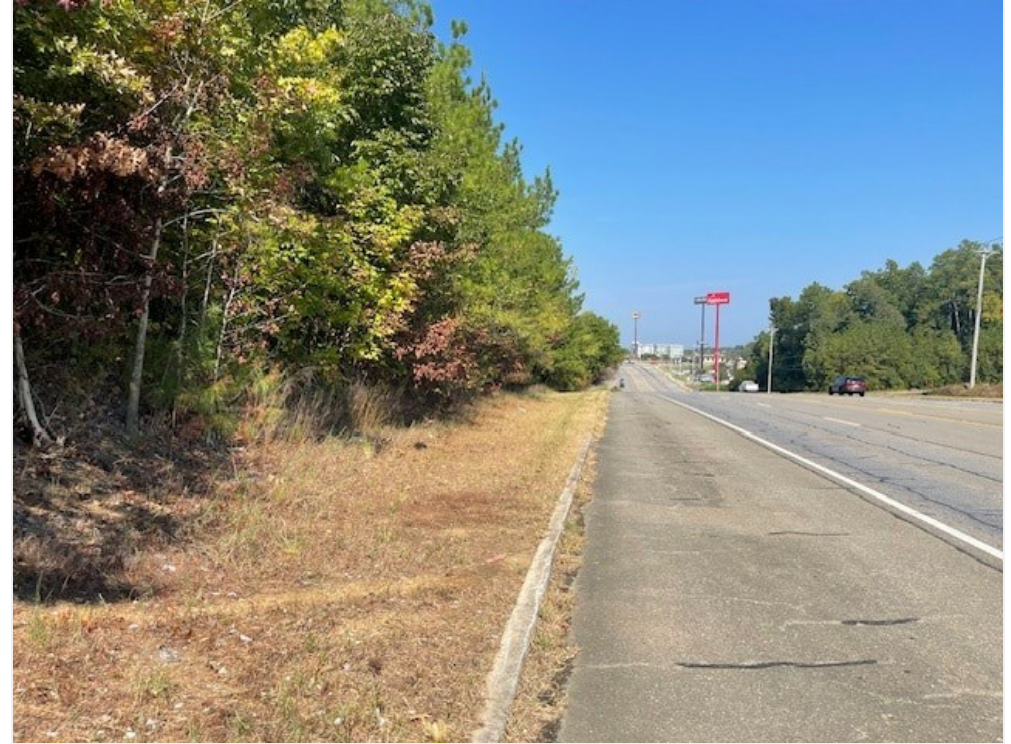
Wide Rd Frontage-2