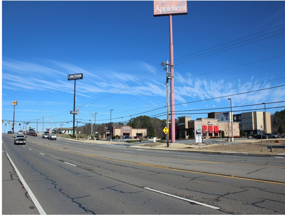
I-75 Exit-312 Intersection