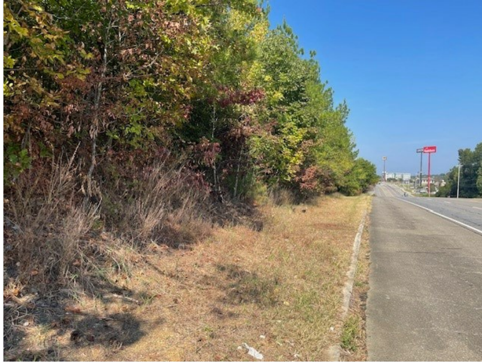
Wide Rd Frontage-1