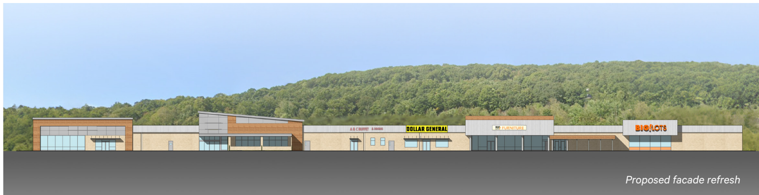
Proposed facade refresh