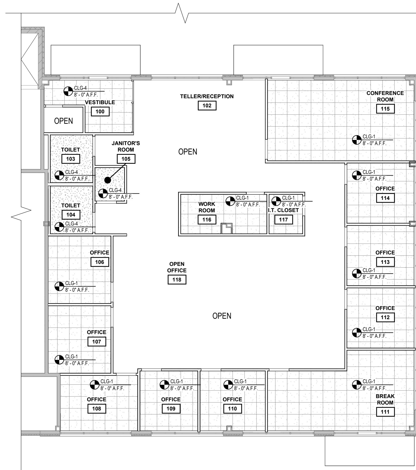
2 FIRST FLOOR REFLECTED CEILING PLAN 1/8" = 1'-0"