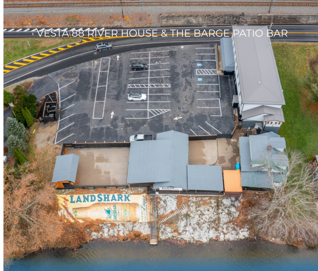
VESTA 88 RIVER HOUSE & THE BARGE PATIO BAR

◆ Reason For Selling: Owner's business plan was to build the restaurant and sell to the right buyer.