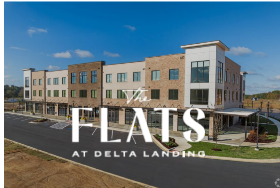
154 Loft Apartments w/Retail & Office Bays

Explore Commercial Space Opportunities with the Exclusive Listing Agents: