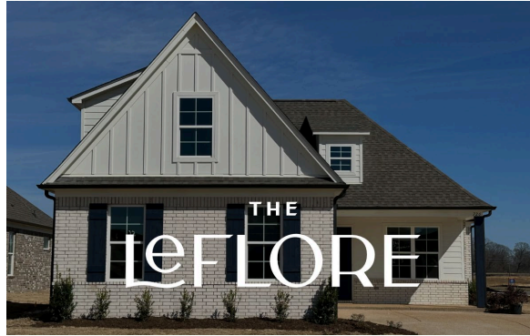
Total of 807 | 55 & Older Community & Traditional Residences FOR SALE