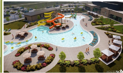
DAN MADDOX $30M+ YMCA