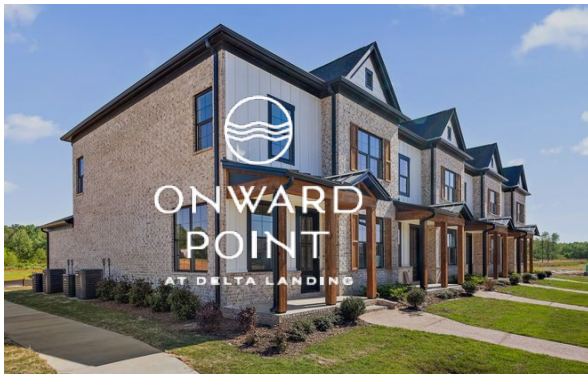
92 Condominiums FOR SALE