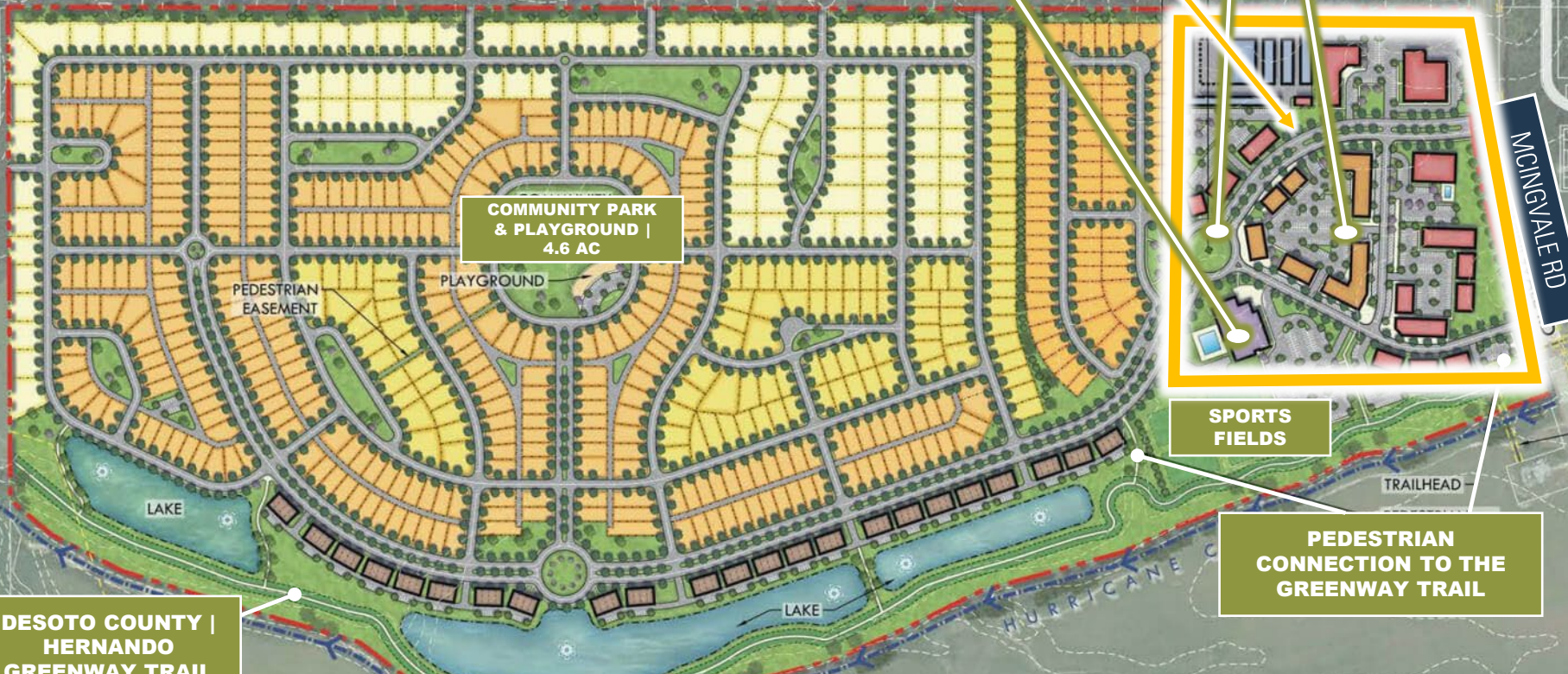
COMMUNITY PARK & PLAYGROUND | 4.6 AC