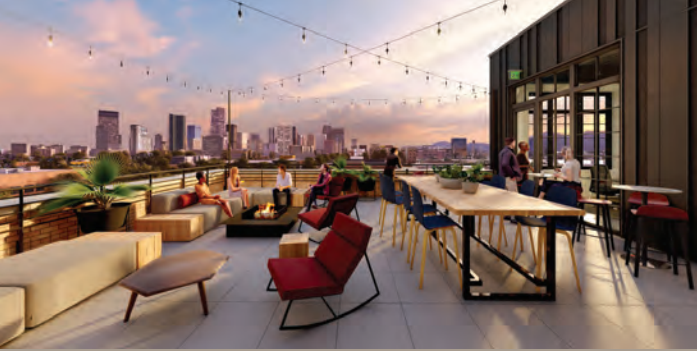
4TH FLOOR PATIO VIEW