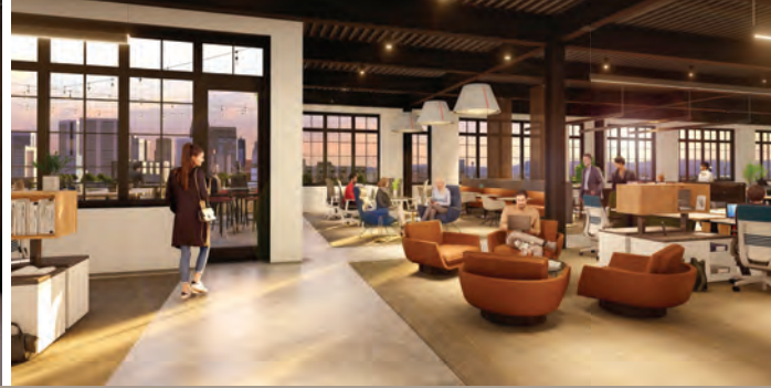
4TH FLOOR TENANT SPACE