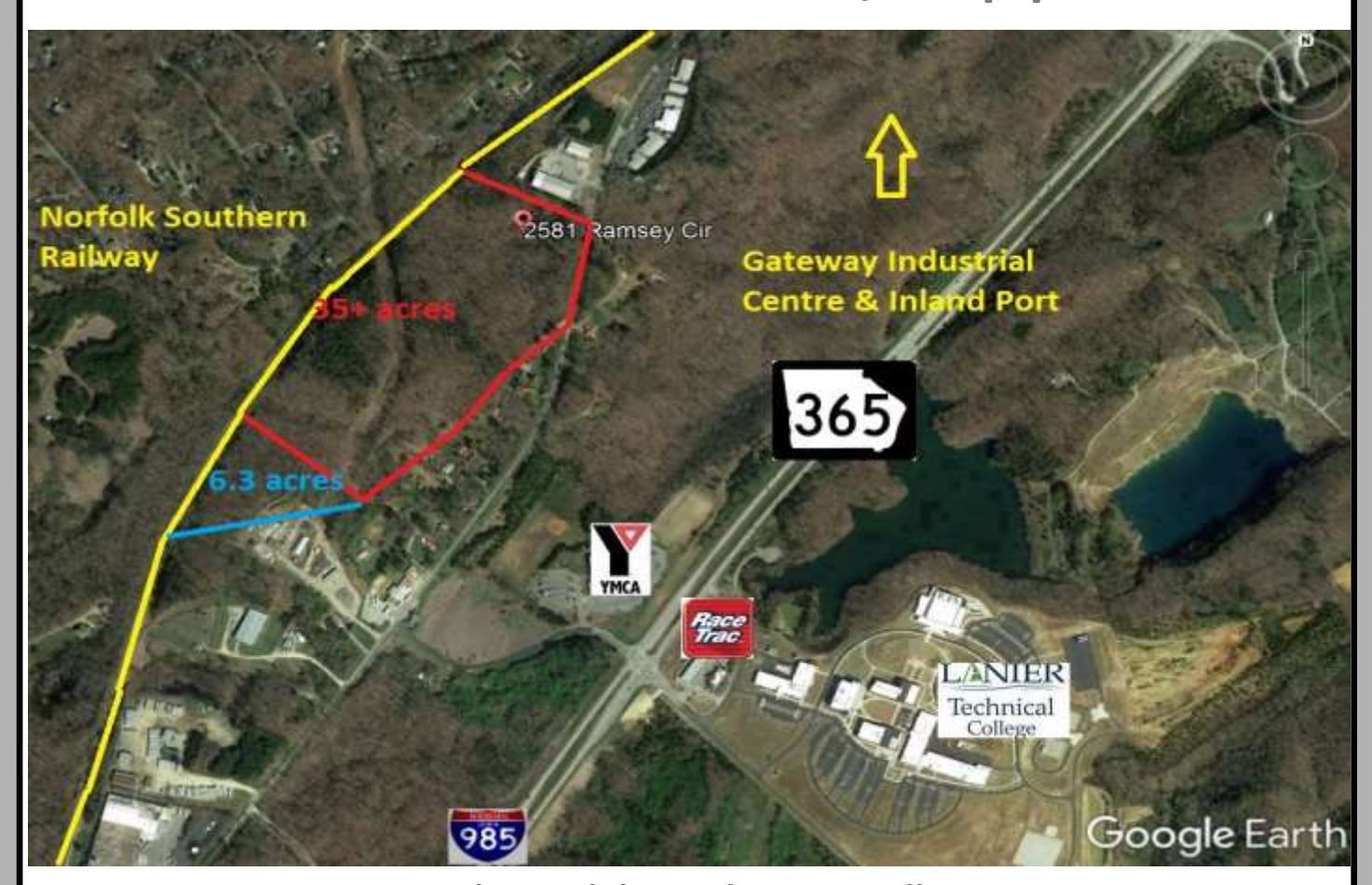
White Sulphur, Rd., Gainesville

Just off Hwy 365 corridor—where the growth is at $30,000 p.p.a