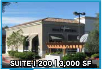
SUITE I-200 | 3,000 SF