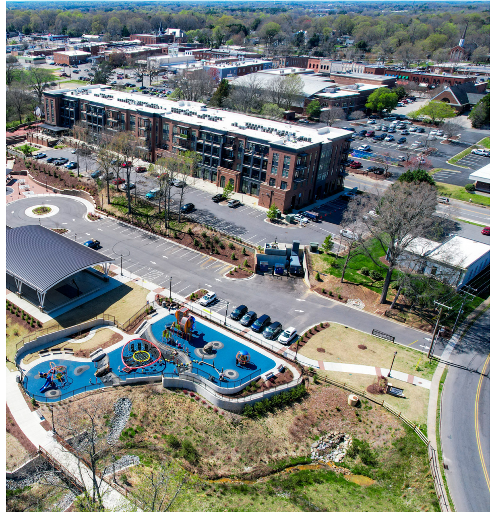
Liberty Park - Adjacent to Property