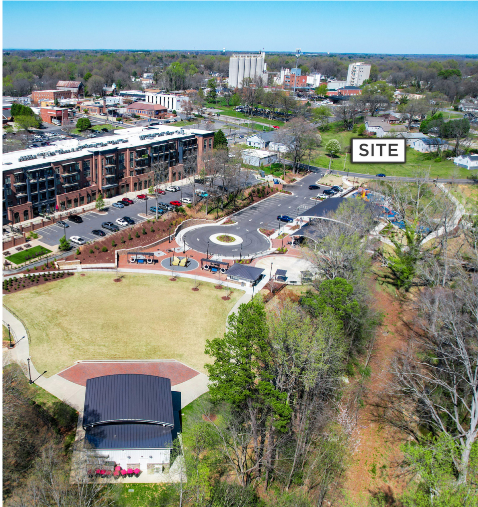
Liberty Park - Adjacent to Property