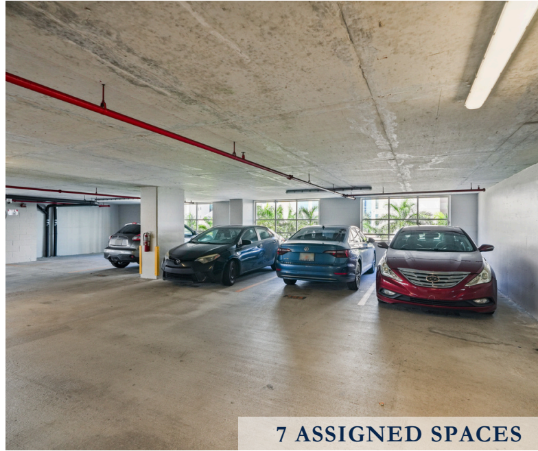
7 ASSIGNED SPACES