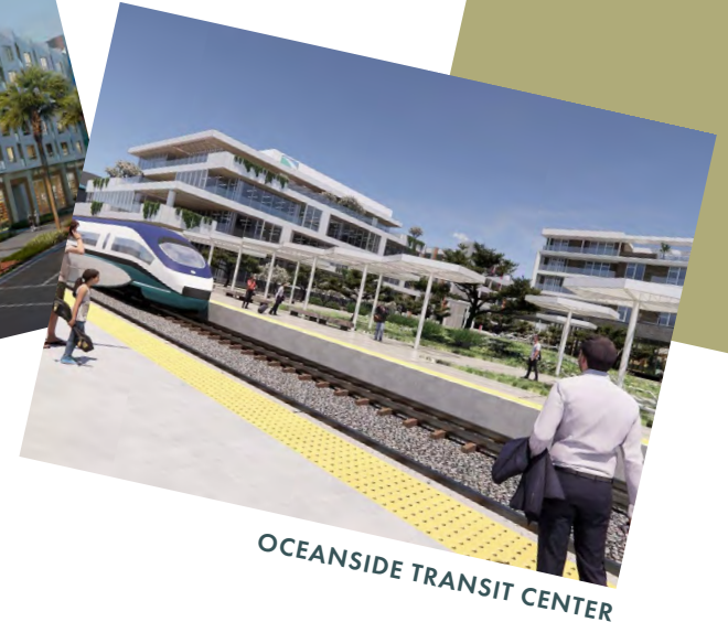
OCEANSIDE TRANSIT CENTER