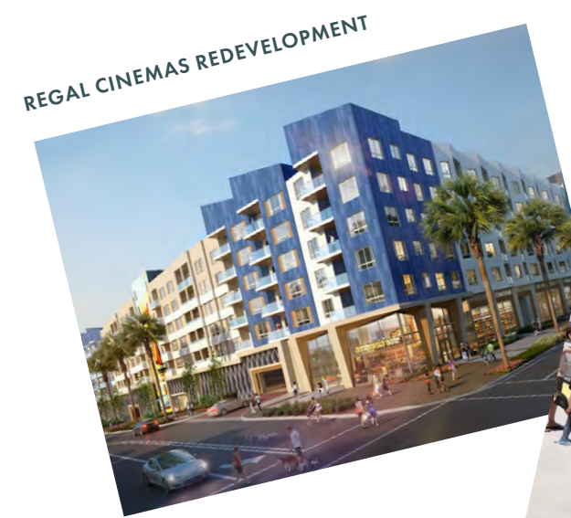
REGAL CINEMAS REDEVELOPMENT

Through investments in transit and public art, the city is elevating livability and identity. The Sprinter rail line—called “California’s best-kept transit secret”—offers affordable connectivity with planned upgrades, while new downtown murals celebrating surf culture and creativity reinforce a vibrant, connected community.