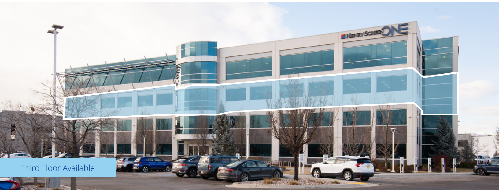
Third Floor Available