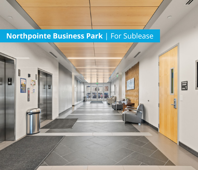
Northpointe Business Park | For Sublease