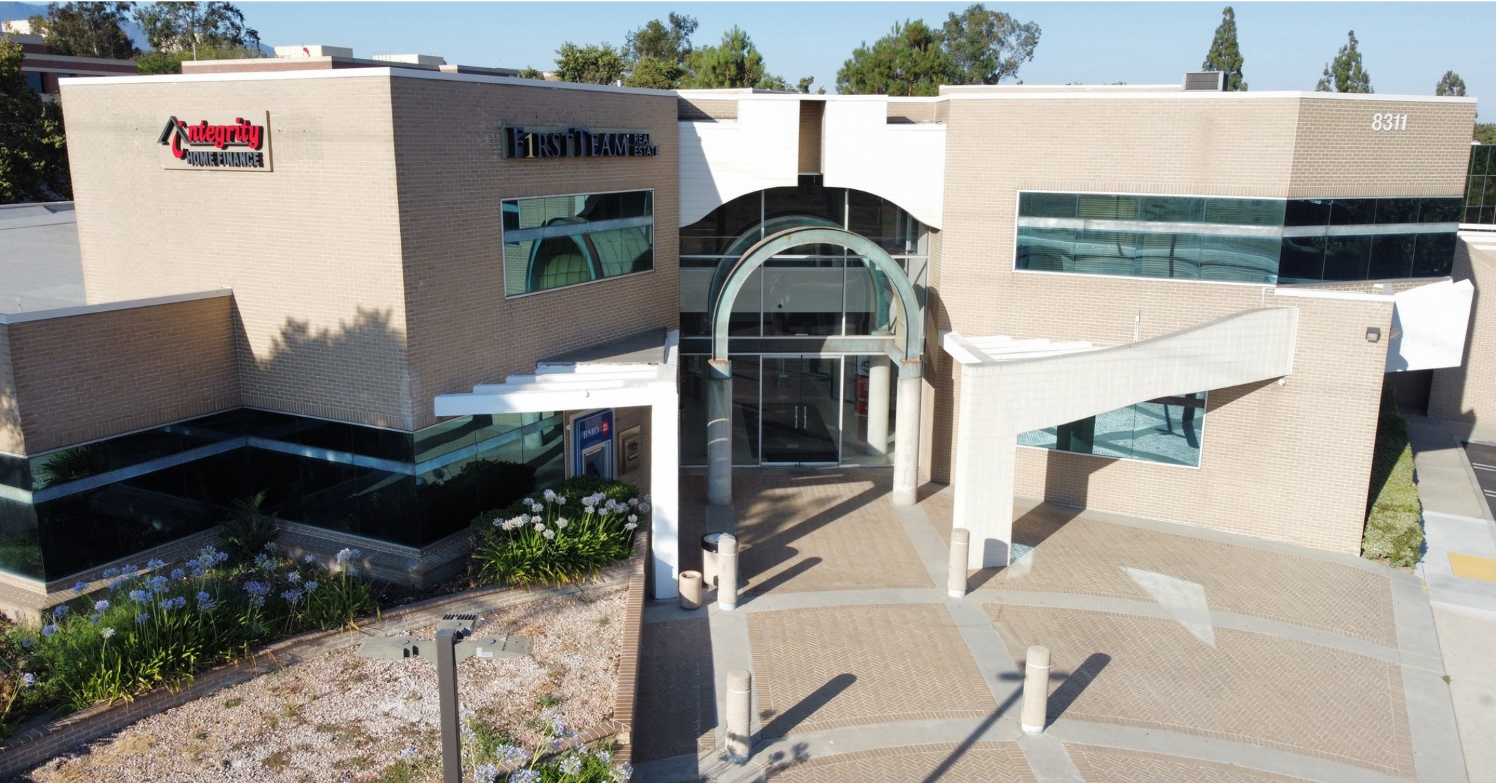
aerial east facing