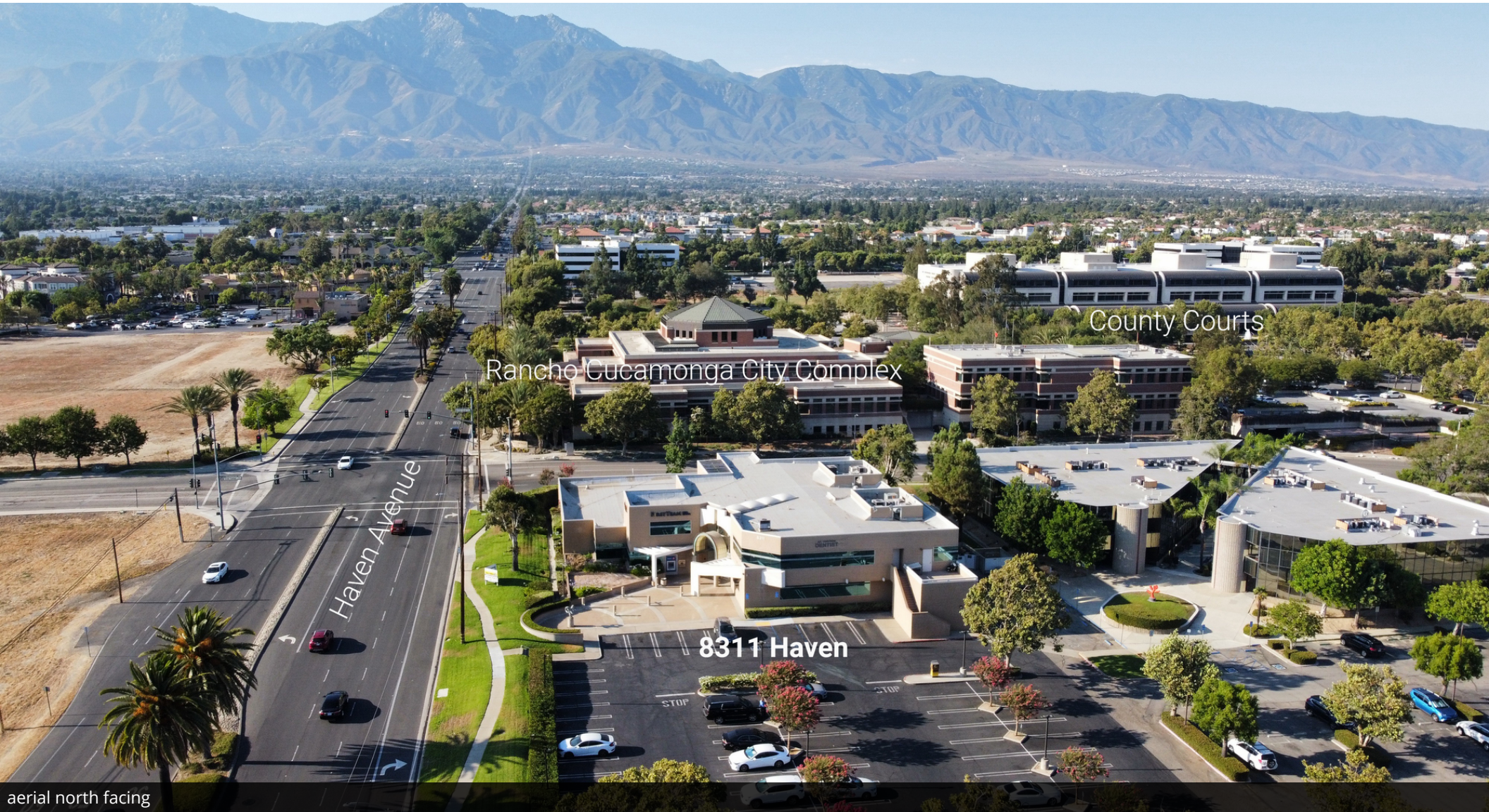
aerial north facing