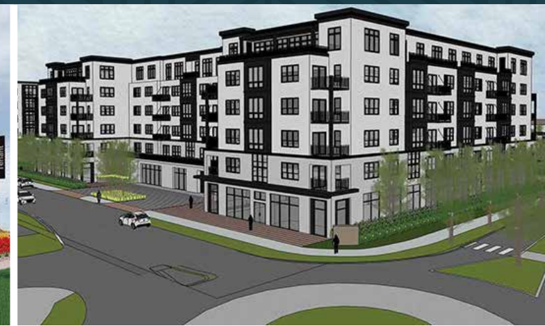
New 200 unit apartment building complex on U.S. Bank building site