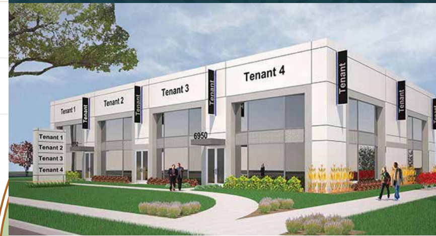
Luigi Bernardi 9,600 SF Retail development project