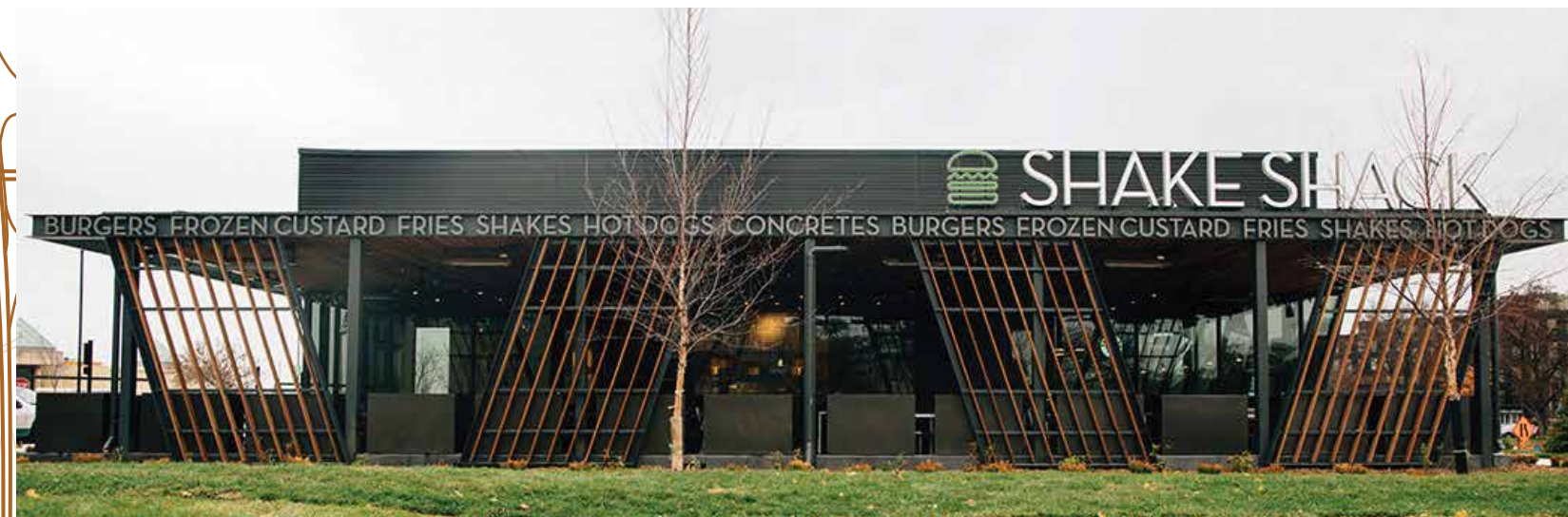
Shake Shack – great choice for quick lunch