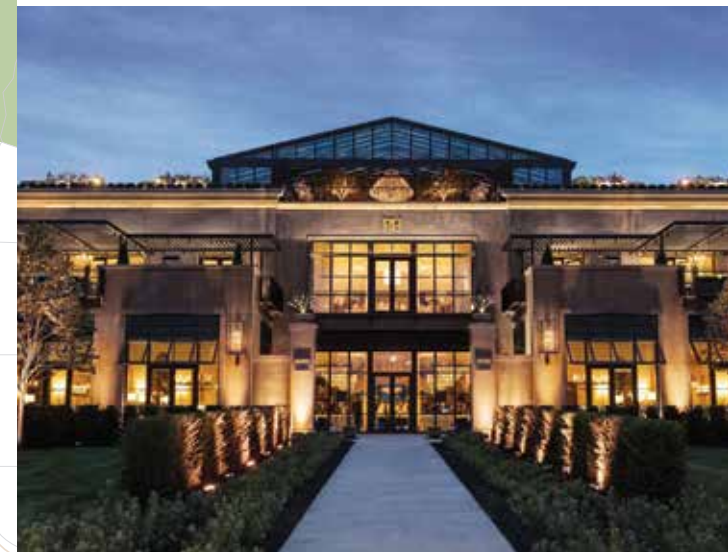
Restoration Hardware Showroom