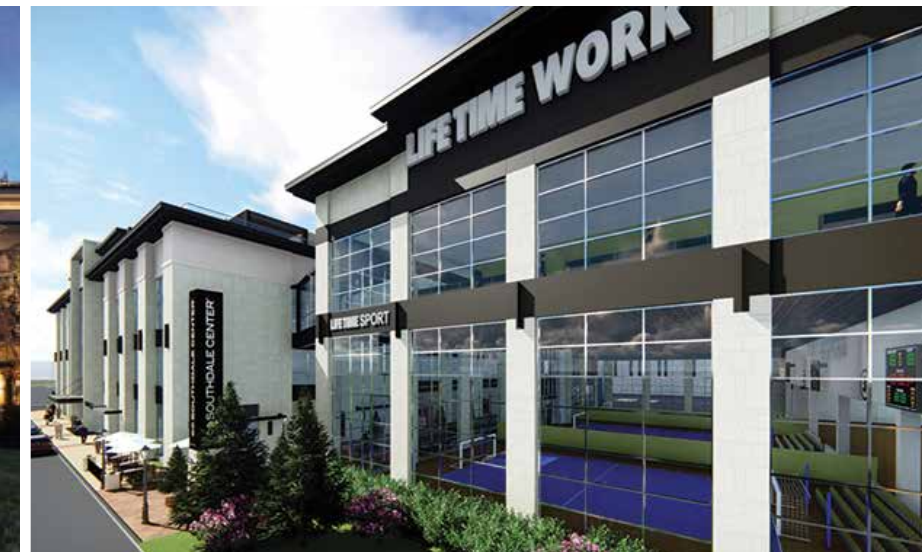
LifeTime Fitness – A new world-class fitness destination