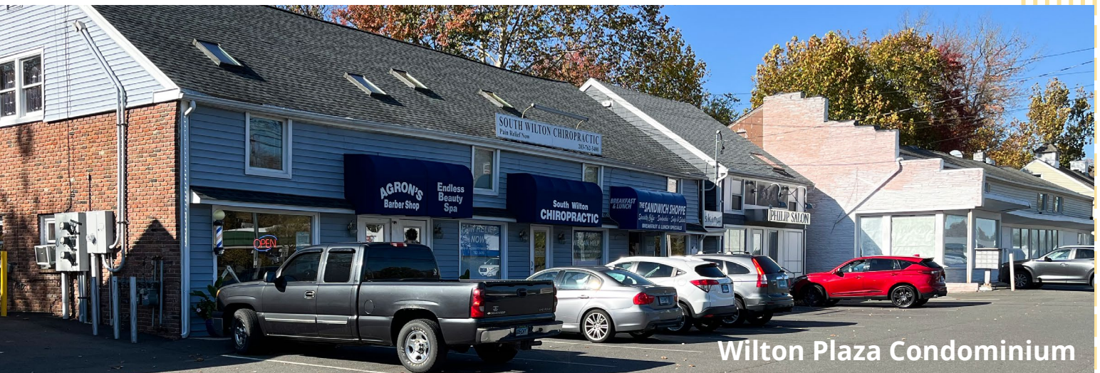
Wilton Plaza Condominium