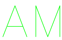
EXHIBIT "A" AM PROPERTIES – 7TH STREET PROPERTY

ALLGEIER, MARTIN and ASSOCIATES, INC. CONSULTING ENGINEERS 7231 EAST 24TH STREET JOPLIN, MISSOURI 64804 (417) 680-7200