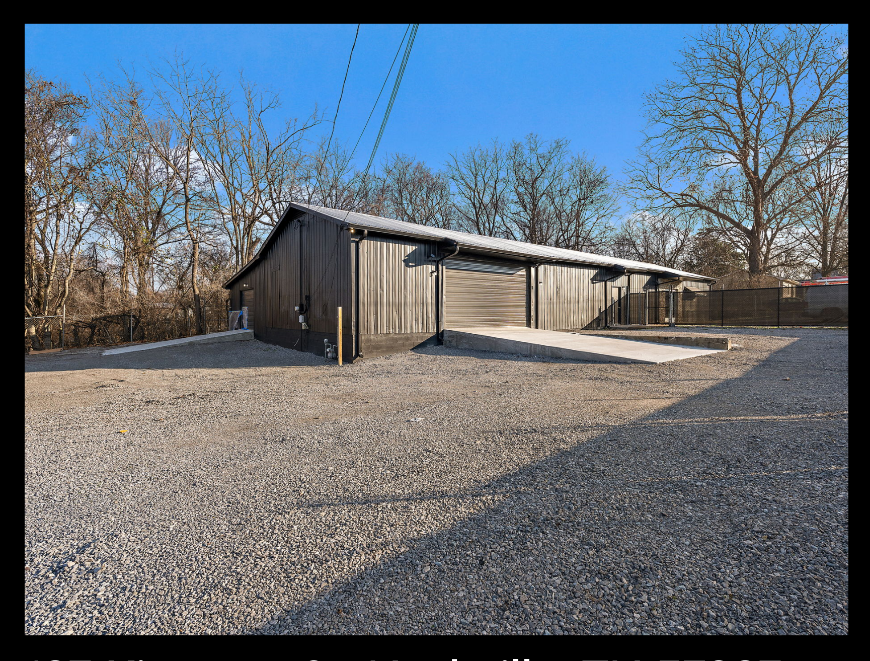
107 Kingston St, Nashville, TN 37207