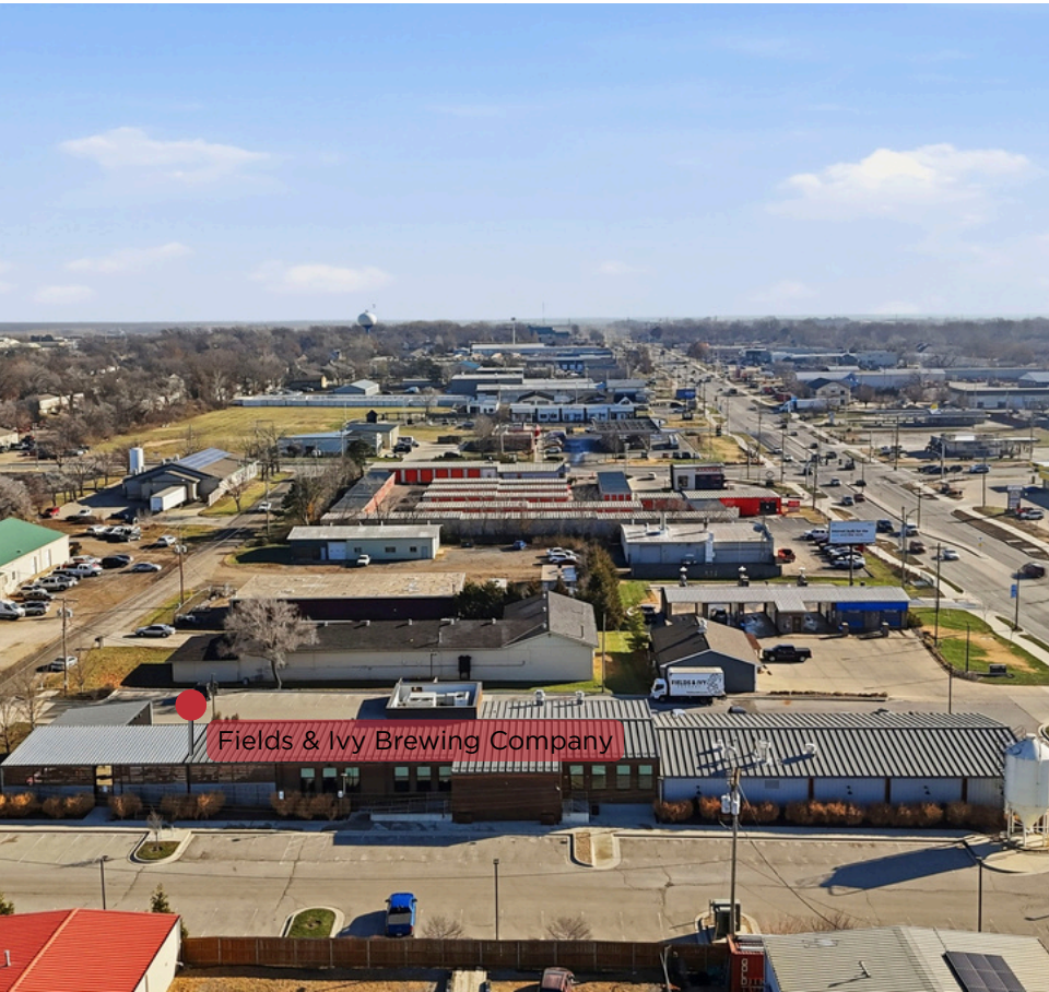
Fields & Ivy Brewing Company