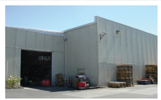
1297 DYNAMIC ST