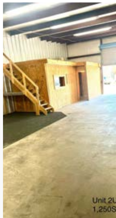
Unit 2U 1,250SF