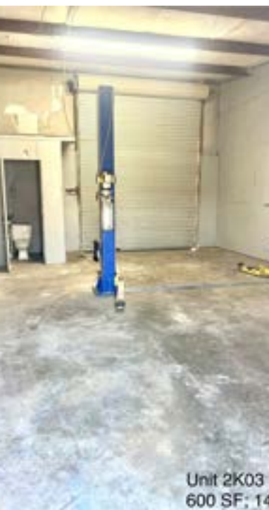
Unit 2K03 600 SF; 14