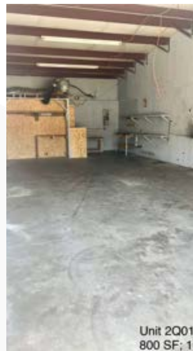
Unit 2Q01 800 SF; 1