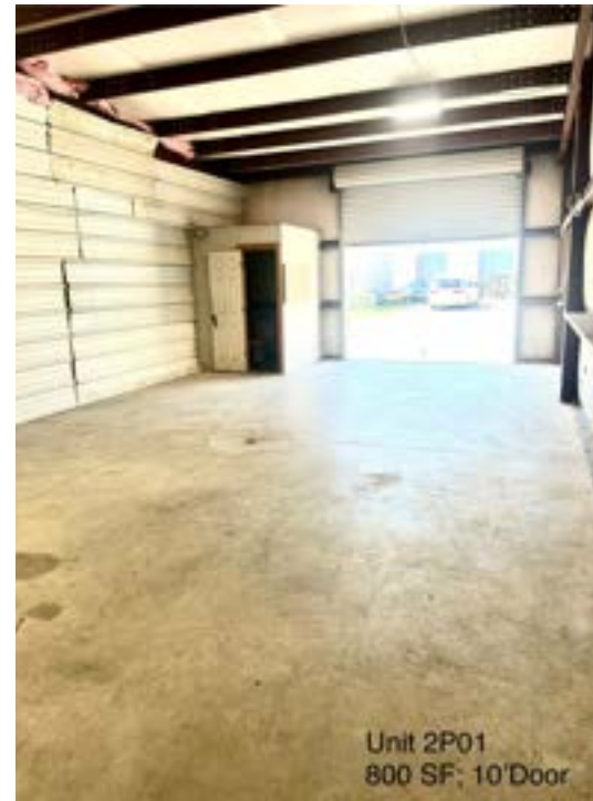
Unit 2P01 800 SF; 10' Door