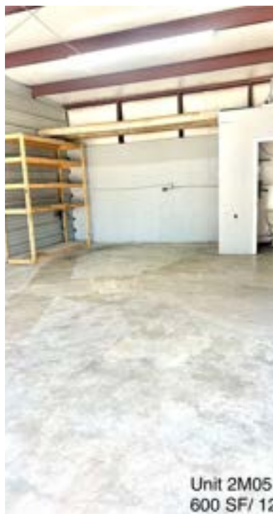
Unit 2M05 600 SF/ 12