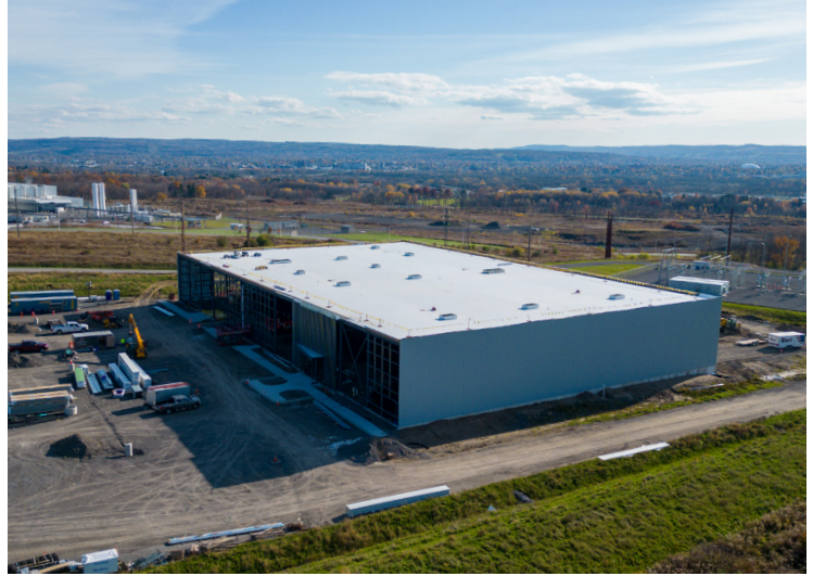
New Construction with 40,000 SF Warehouse