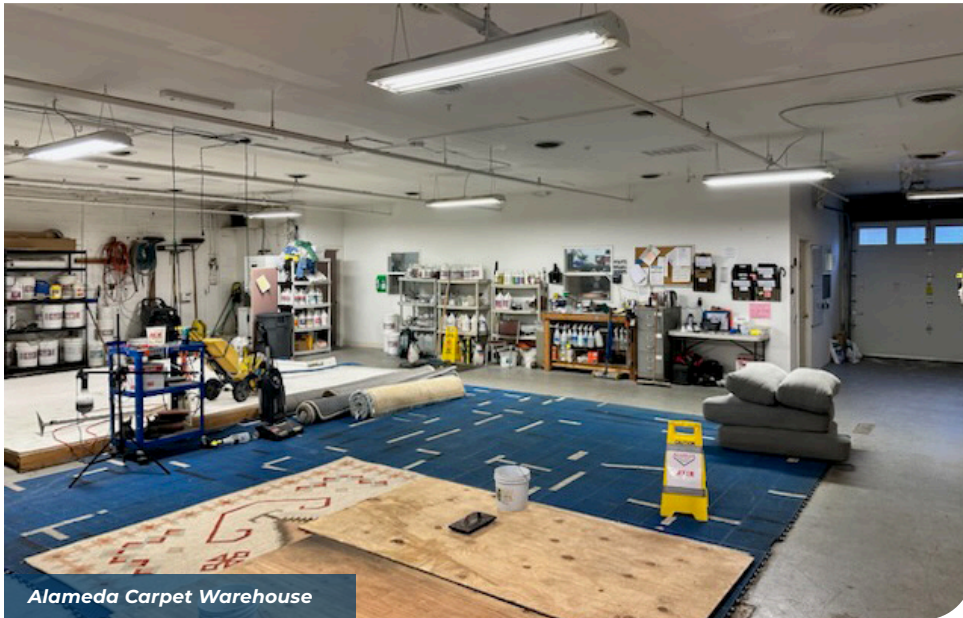
Alameda Carpet Warehouse