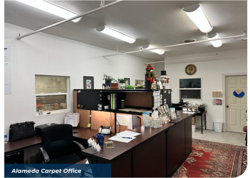
Alameda Carpet Office