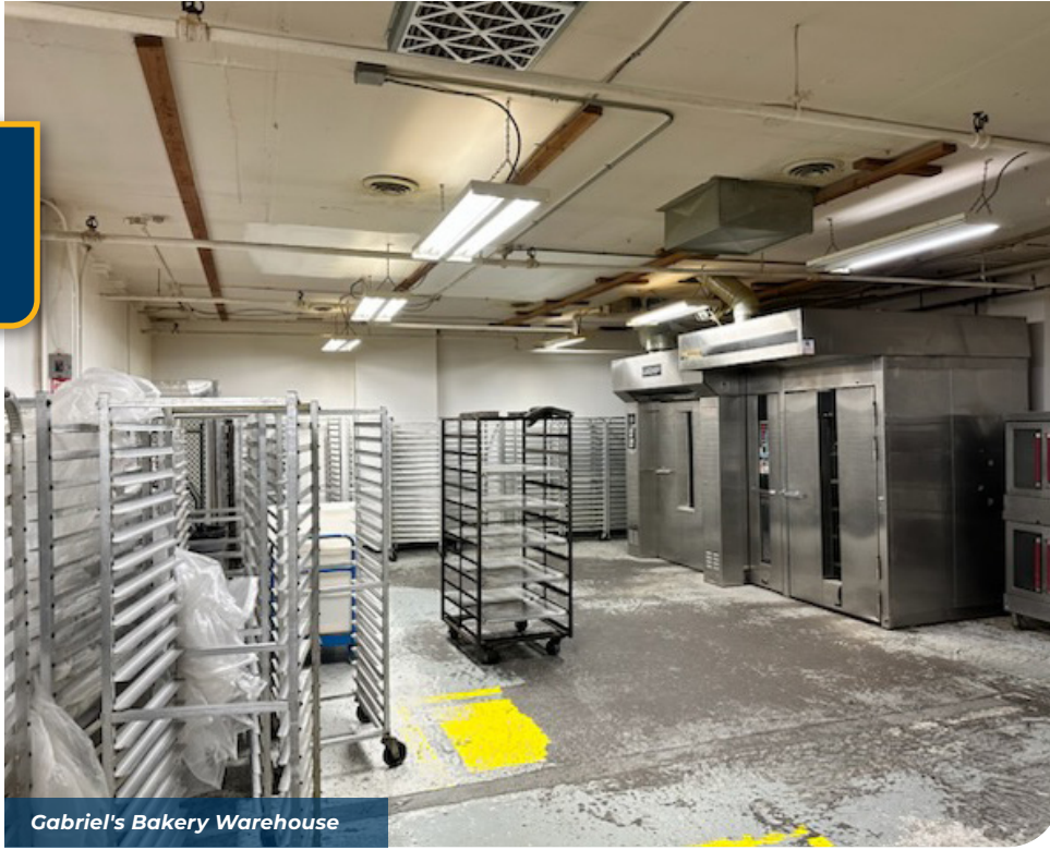
Gabriel's Bakery Warehouse