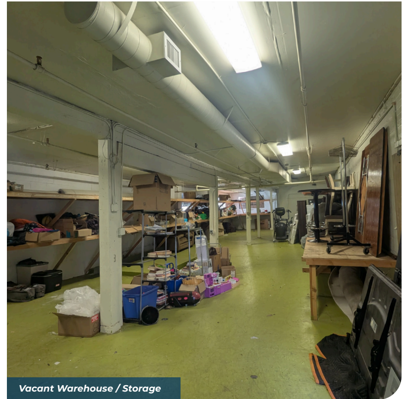
Vacant Warehouse / Storage