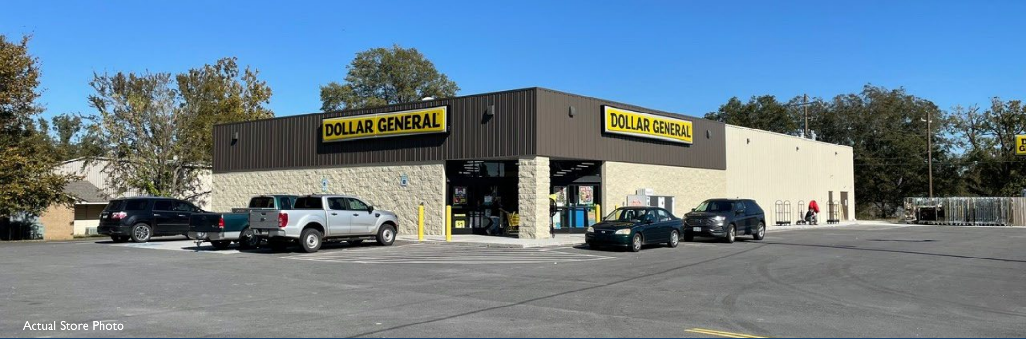
Actual Store Photo

Over 9 Years Remaining – 5 (5 Year) Options - Corporate Guaranteed Lease