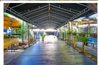
ENCLOSED DROP-OFF AREA