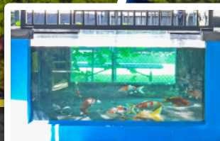
ZOO-GRADE KOI POND