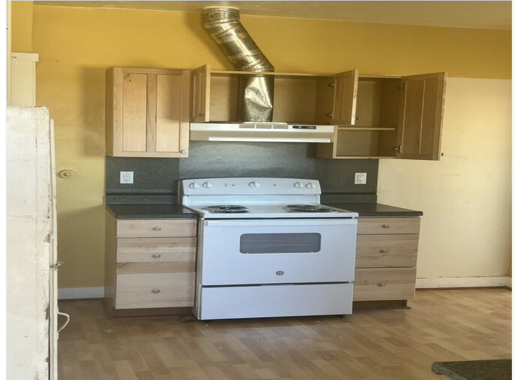
Q ST KITCHEN