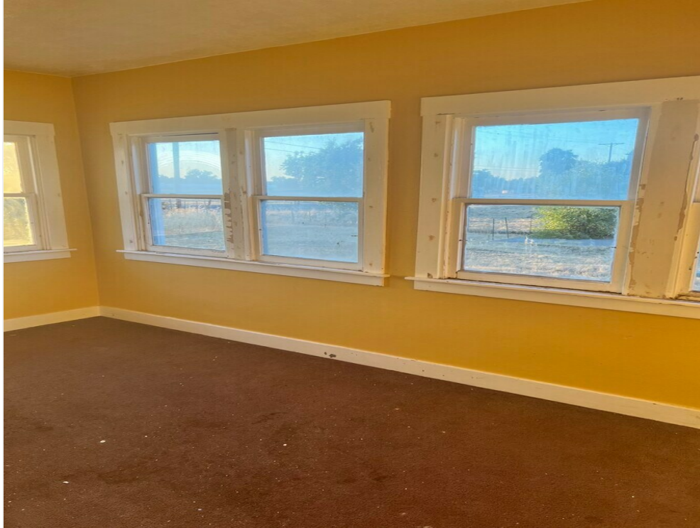
Q ST BED