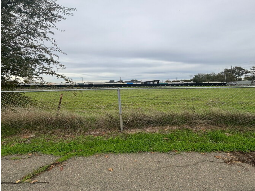
Q ST N. SIDE