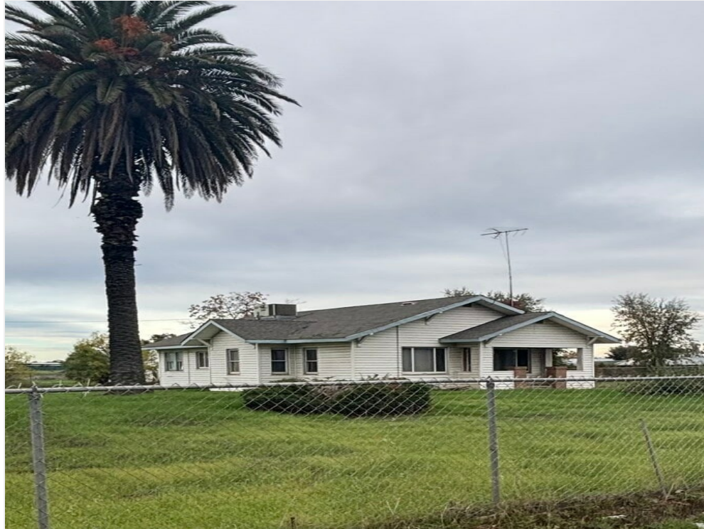
Q ST FRONT