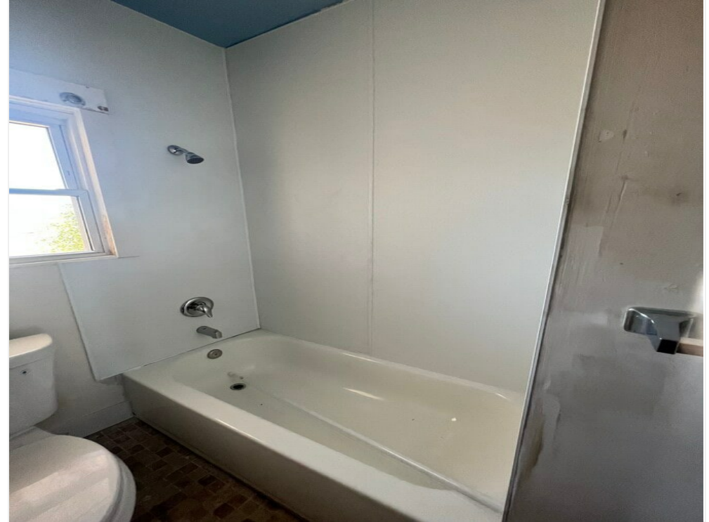
Q ST BATH