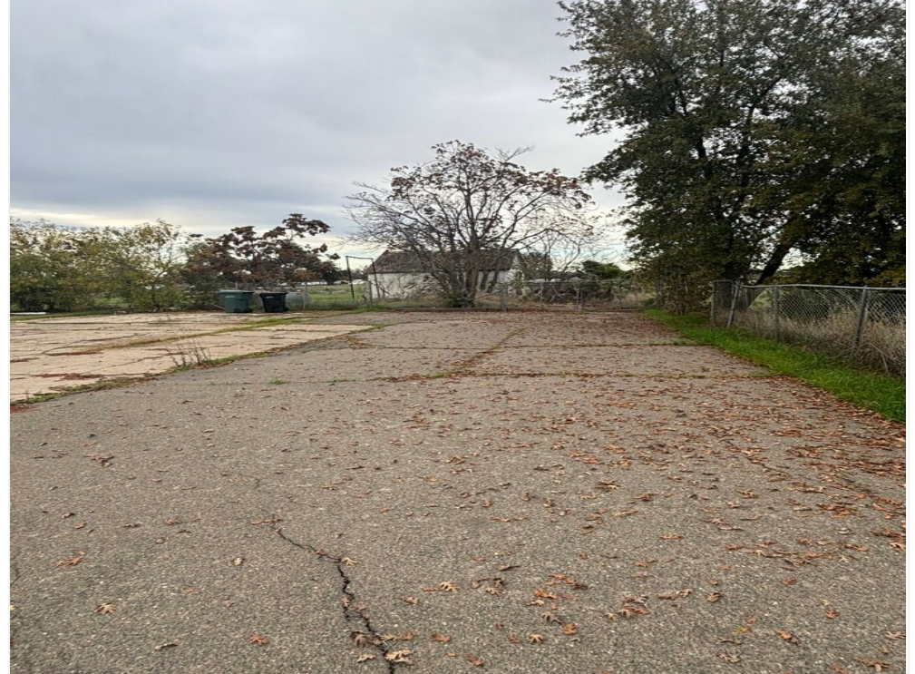
Q ST DRIVEWAY