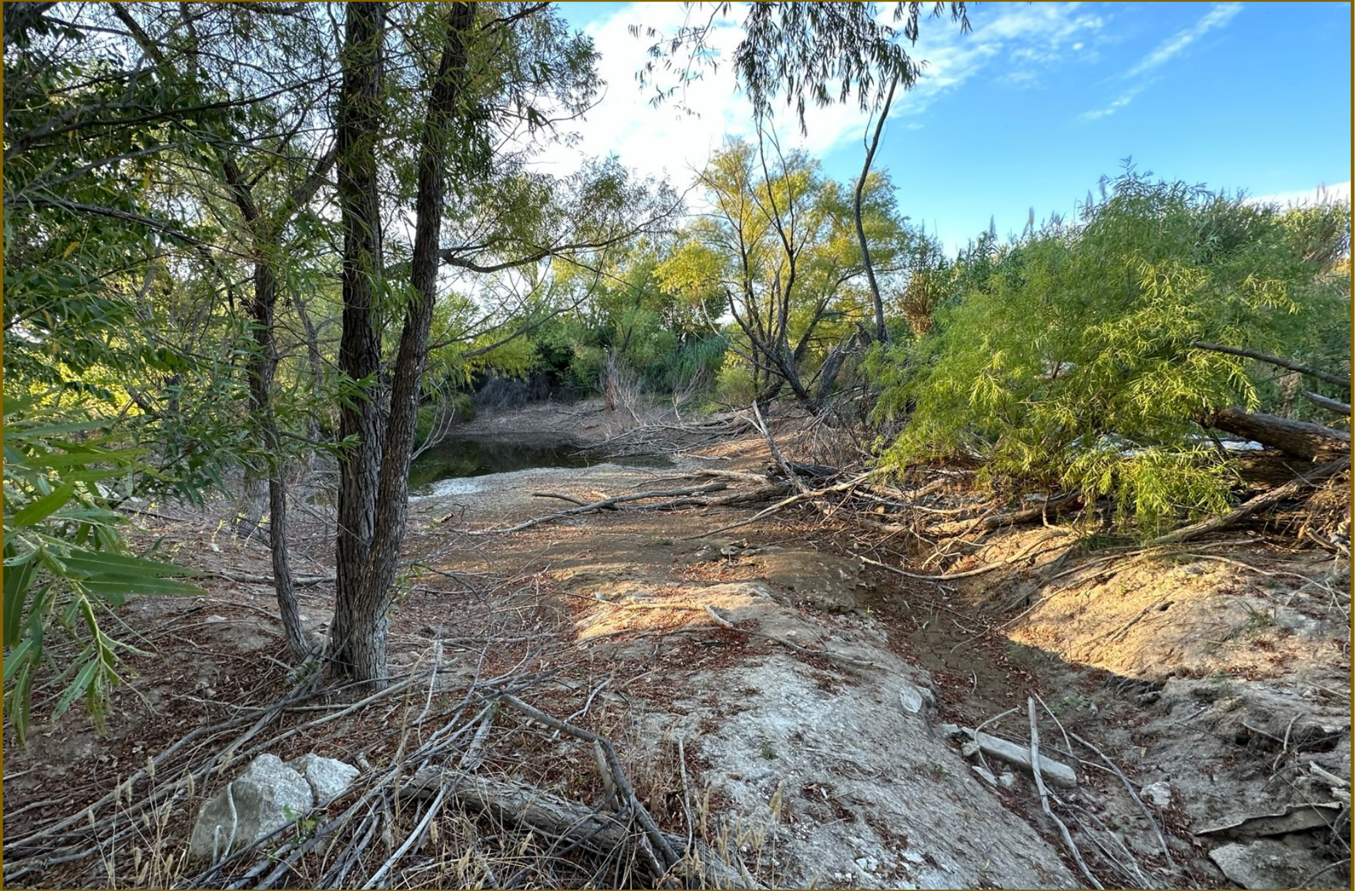
PHOTO OF THE POND ON THE INDUSTRIAL/COMMERCIAL LAND FOR SALE 12.85 ACRES HWY 377 FRONTAGE LOCATED AT EAST US HWY 377 & INDUSTRAIL AVE, GRANBURY TX 76049

CONTACT: MARK FISHER (713) 614-3286 fisher.jmark@gmail.com