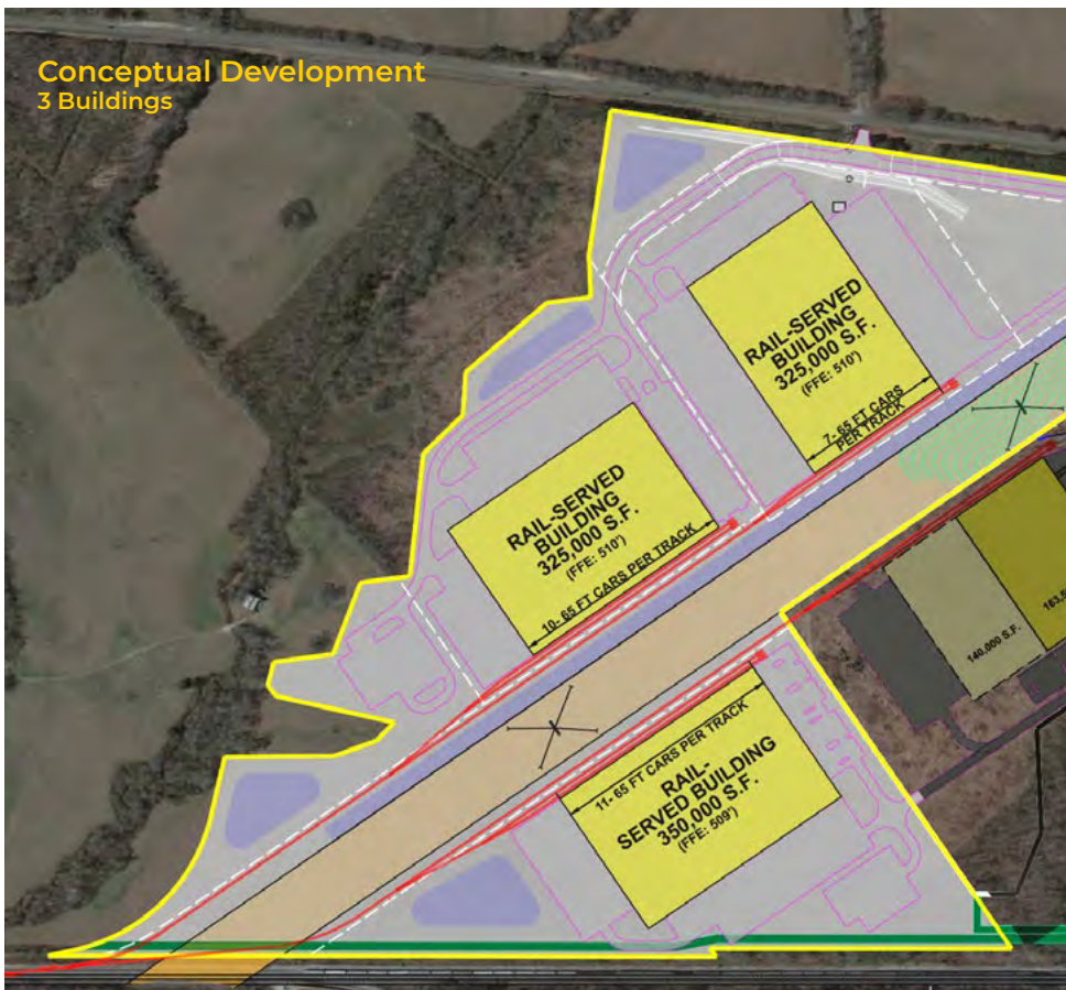
Conceptual Development 3 Buildings

88 acres of land stands ready for your project. With up to a million SF on rail, supply chain issues are a thing of the past.