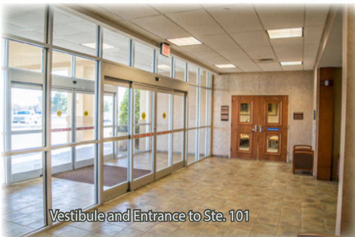
Vestibule and Entrance to Ste. 101