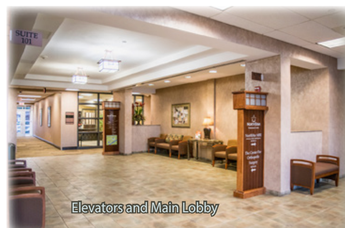
Elevators and Main Lobby