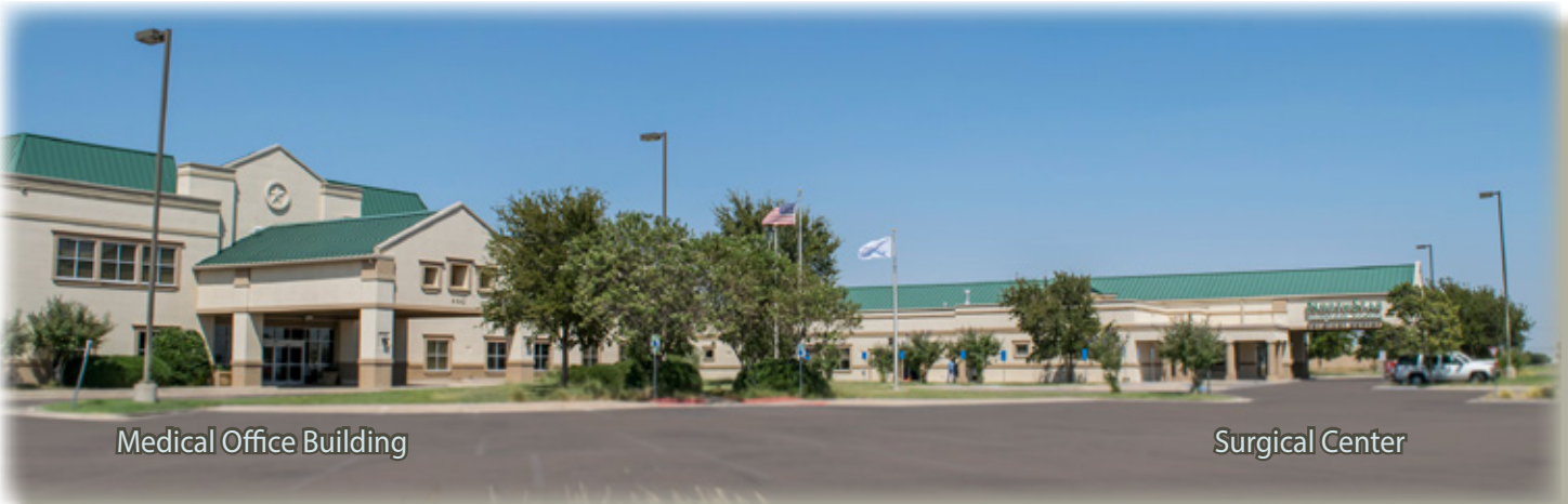
Medical Office Building