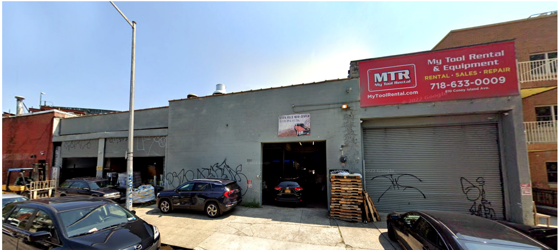
BACK OF BUILDING LOCATED ON EAST 9TH STREET

4 Units | 10,230 SF Building and Commercial