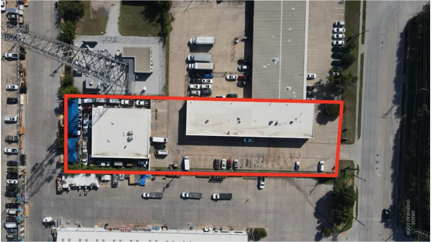
Actual as-built conditions may vary