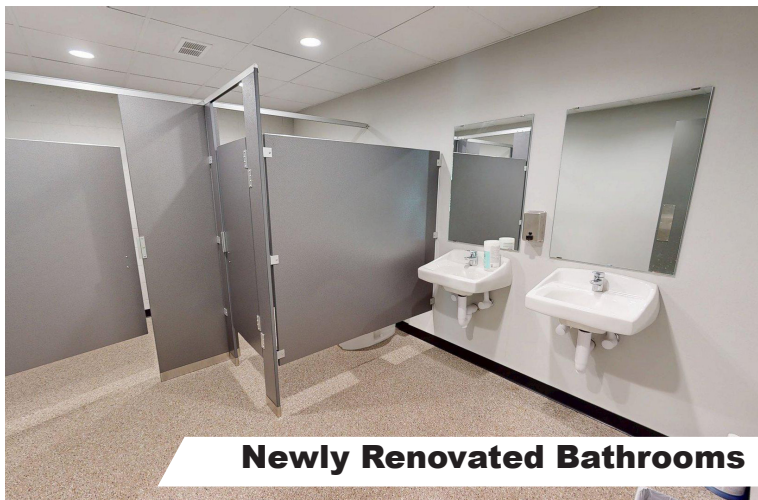
Newly Renovated Bathrooms