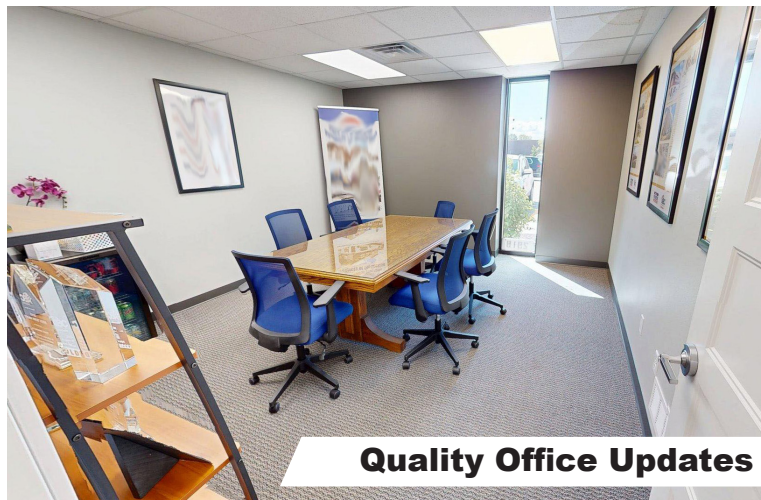
Quality Office Updates