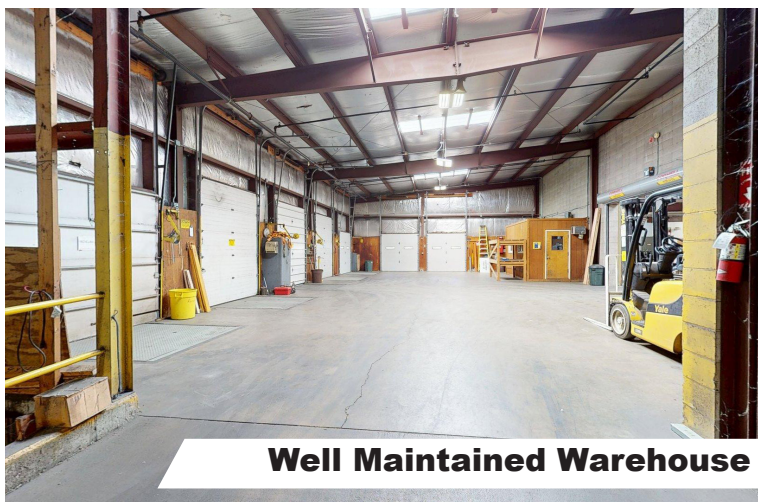
Well Maintained Warehouse