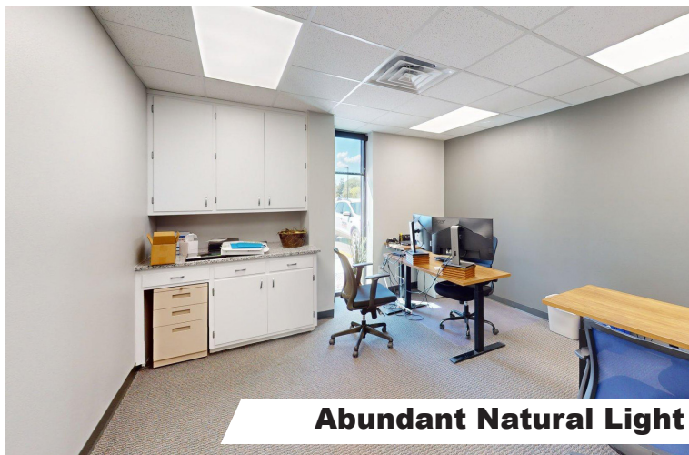
Abundant Natural Light