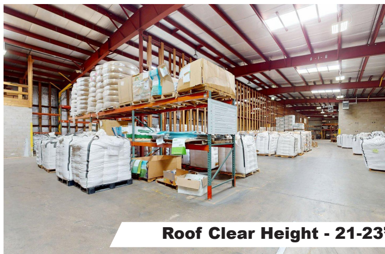
Roof Clear Height - 21-23'