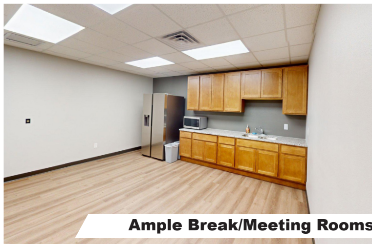
Ample Break/Meeting Rooms