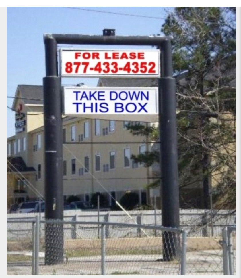
12.78 LAND FOR LEASE IMMEDIATE