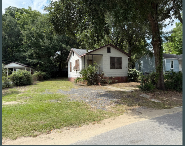
2308 Bailey Dr