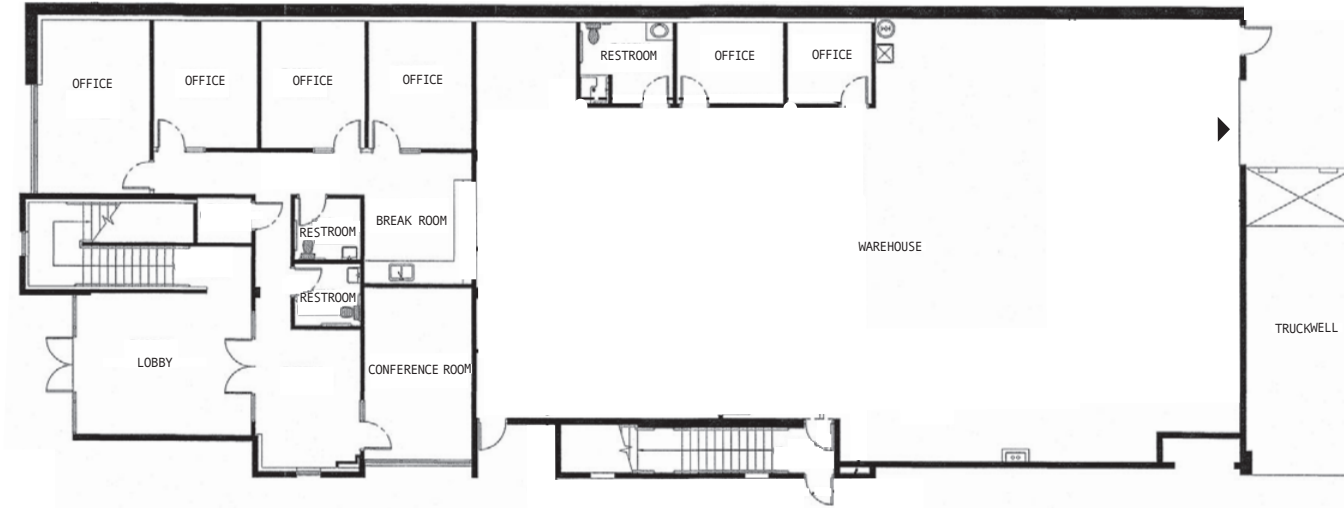
FIRST FLOOR - ±7,550 SF ( WAREHOUSE: ±4,700 ) ( OFFICE: ±2,850 SF )