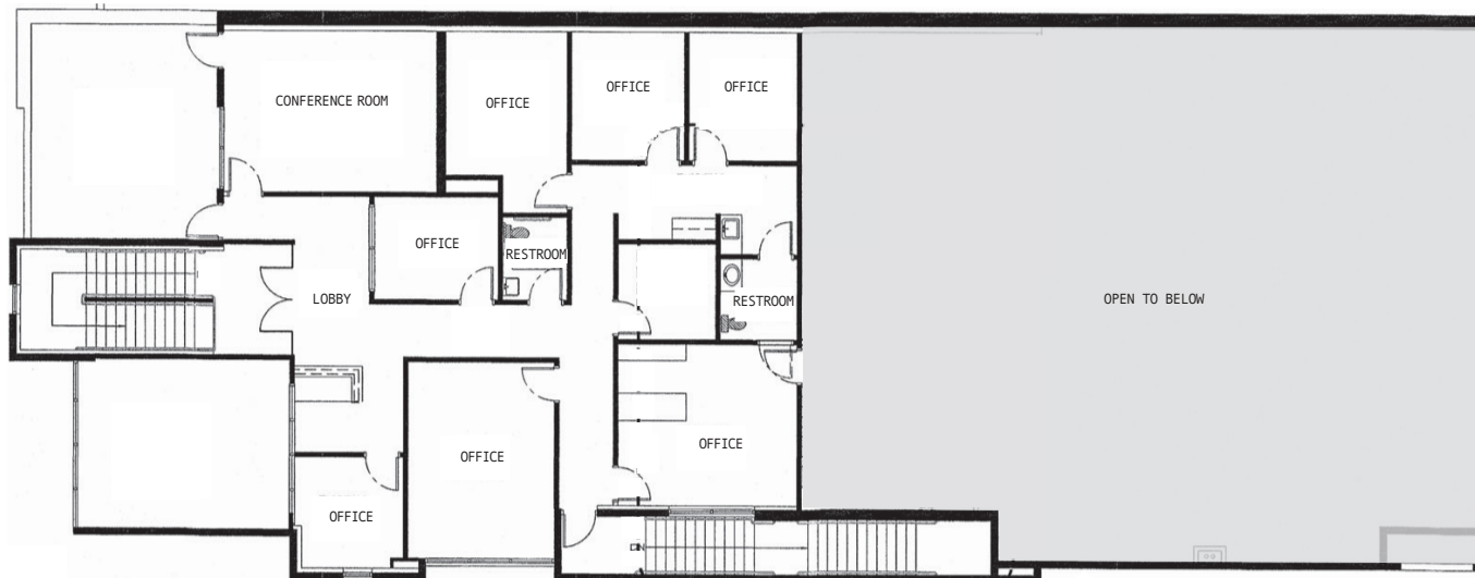
SECOND FLOOR - ±3,050 SF