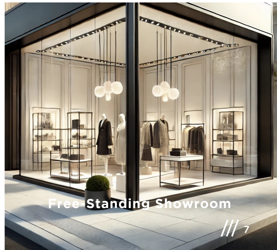
Boutique - Commercial Building