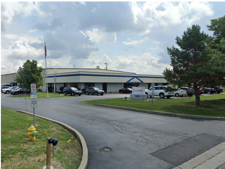
6351 Inducon Dr. East, Sanborn, NY 42,800 sq. ft.