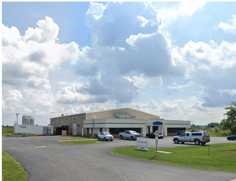
6357 Inducon Dr. East, Sanborn, NY 16,500 sq. ft.

Opportunity to acquire Two (2) adjacent industrial buildings totaling 60,000 sq. ft. on 10.5 acres in the Inducon Industrial Park. Owner will consider selling separately. Located in the Inducon Industrial Park behind Niagara Falls Air Base and the new 2 million sq. ft. Amazon Facility currently under construction.