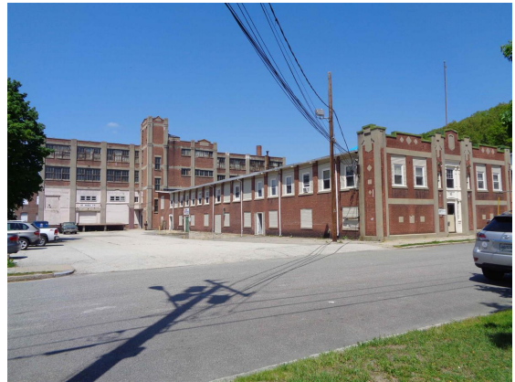
( https://images.vgsi.com/photos/WoonsocketRIPhotos//2342.JPG )